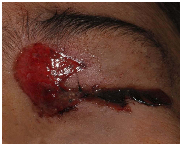
Figure 1 Severe eye trauma with eyelid laceration and open globe injury in a child with firework injury.

Based on the results obtained from this study for the patients with ocular injuries due to fireworks, it was