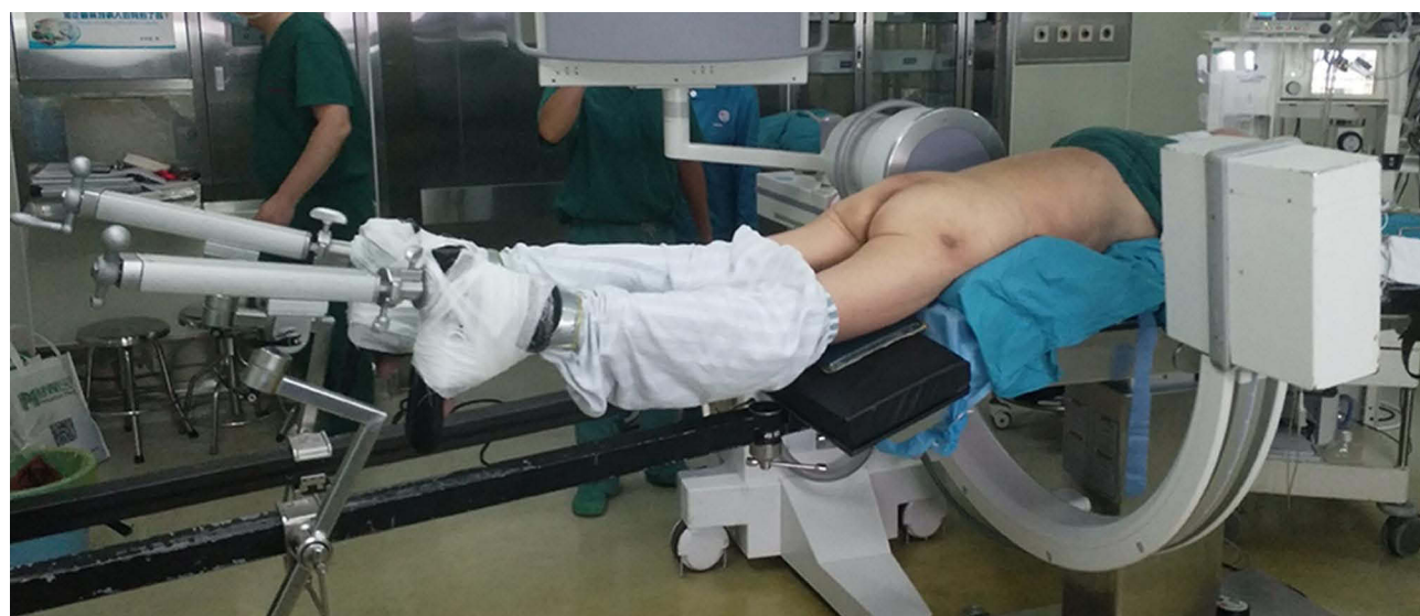
Figure 2 Intraoperative traction using traction bed under general anesthesia for the case refractory to the postural reduction and preoperative traction (PT).

Compared with those on admission, after traction, the IVA changed from 3.4^\circ \pm 6.8^\circ to 8.1^\circ \pm 7.3^\circ , the disc height changed from 5.7 \pm 1.2 mm to 8.6 \pm 2.6 mm, the AVH changed from 10.7 \pm 3.2 mm to 18.5 \pm 2.8 mm, and the PVH changed from 25.7 \pm 4.2 mm to 26.2 \pm 7.1 mm. There were significant differences in IVA, the disc height, AVH and PVH between on admission and after traction ( P < 0.05 ) (Table 2).