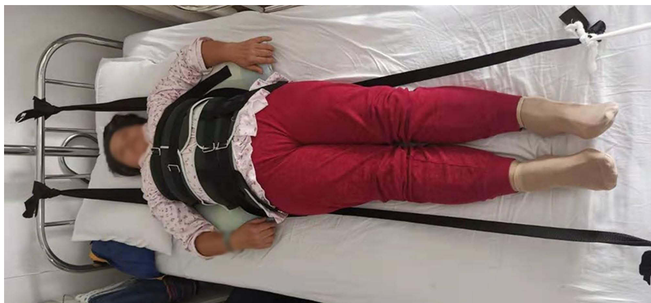
Figure 1 Preoperative traction (PT) using lumbar traction apparatus for the treatment of severe thoracolumbar osteoporotic vertebral compression fractures (OVCFs).

All operations were performed under general anesthesia. The patients took a prone position and the operating bed