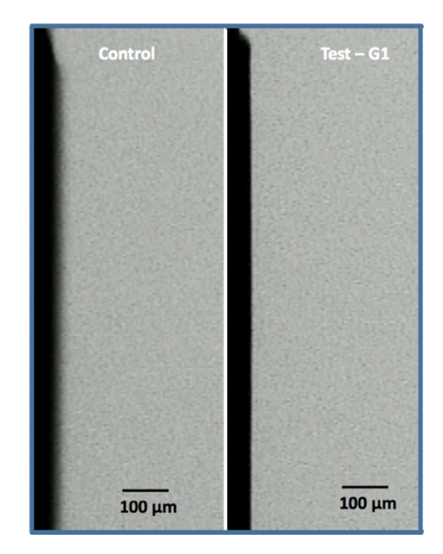
Figure 2 Example microradiographs of enamel initially eroded (left – Control) and after treatment with treatment regime GI for four weeks (right – Test).

The fluoride mouthrinses were prepared under Good Manufacturing Practices by Nanotech as follows. A cylindrical