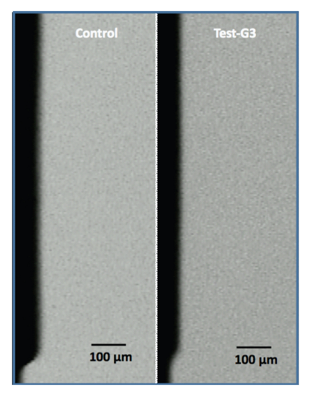
Figure 4 Example microradiographs of enamel initially eroded (left – Control) and after treatment with treatment regime G3 for four weeks (right – Test).

going to bed. Subjects were instructed to neither rinse their mouth nor take any drink for at least 30 minutes after rinsing. Also included in the instructions was to record the number and time of toothbrushing each day in the diary provided; refrain from the use of any other oral hygiene products for the duration of the trial; maintain their normal dietary habits; and return the remaining toothpaste and mouthrinse after each study phase. The weight of toothpaste and mouthrinse were measured before and after the study phase. This was done to monitor compliance, ensure that the subjects discontinue the use of the previous product, and ensure uniformity in the use of the oral hygiene product, which may otherwise unduly influence the de-/remineralization cycle during the study periods. After each 28-day period, the appliance was detached, and after the washout period the next appliance was cemented in place on the same tooth as the first appliance. This procedure was repeated until the three phases were completed by each subject. At the detachment of the appliance, any bonding agent left on the tooth surface was carefully and completely removed with composite-removing burs.