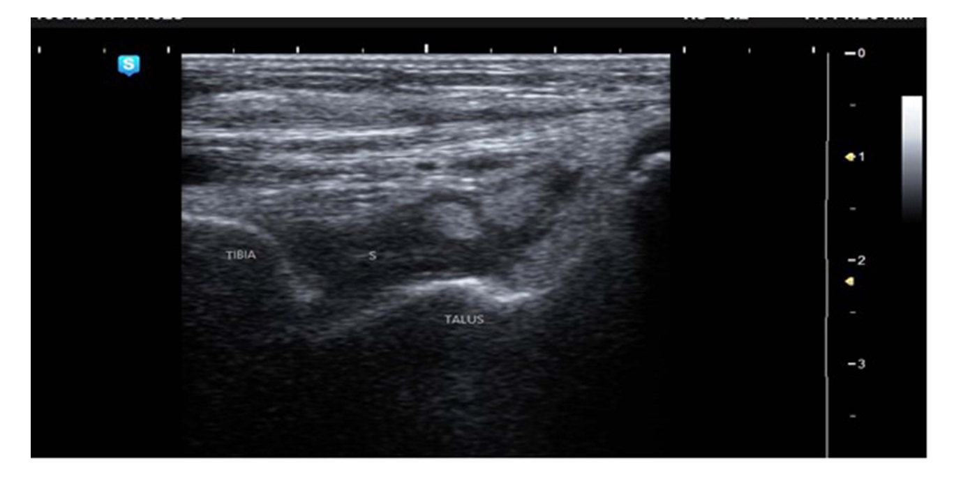
Figure 3 Long-axis view gray-scale US of right ankle joint in the same patient showing tibiotalar joint synovitis grade 3 (synovial hypertrophy and effusion). Abbreviation: S, synovitis.

in the general population.<sup>28</sup> Obesity, on the other hand, is not considered as a risk factor in this study as most of our patients have BMI of >20 to \leq 25 (90%), and (10%) have BMI of >25 to \leq 30. Sixty percent of them have hyperuricemia.