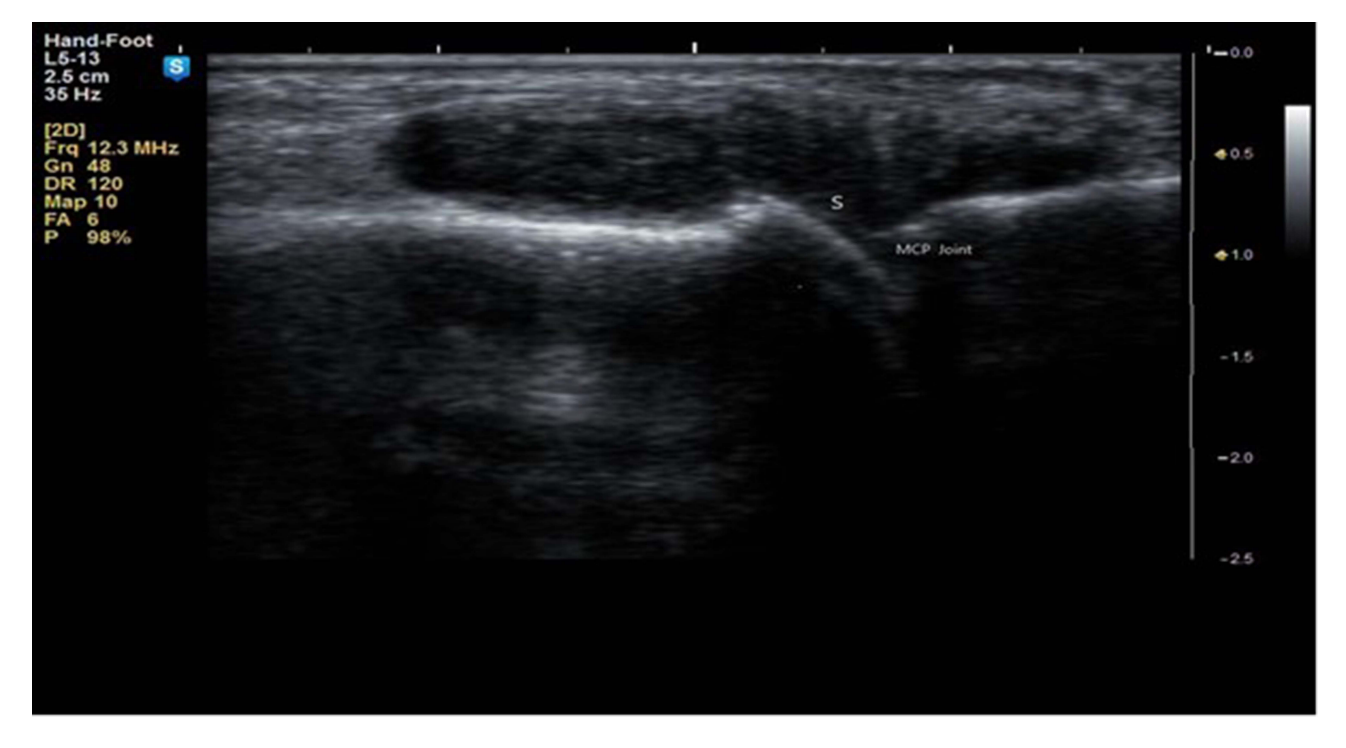
Figure 2 Gray-scale US long-axis view of MCP joint of right index finger of the same patient showing synovitis grade 3 (synovial hypertrophy and effusion). Abbreviations: MCP, metacarpophalangeal joint; S, synovitis.

Abbreviations: R, radius bone; L, lunate bone; C, capitate bone; S, synovitis.