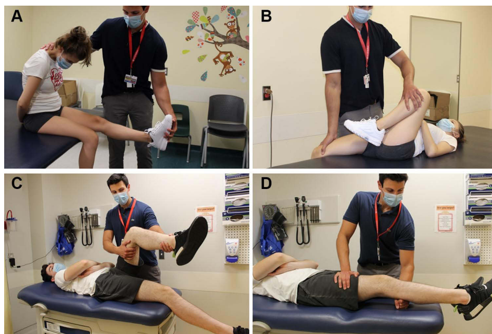
Figure 1 Special testing with caregiver assistance. (A) Slump test: Caregiver may assist by supporting neck flexion and adding passive ankle dorsiflexion. (B) Gaenslen's test: Caregiver can apply pressure on the lowered leg and opposite leg at the knee. (C) FADER + isometric IR: Caregiver performs movements passively then provides resistance against IR. (D) Lever sign/Lelli's test: with patient lying supine, caregiver positions their fist beneath one calf and then applies downward force on the distal femur.

the SIJ and reproduce pain. We recommend that a caregiver assists in performing all the aforementioned tests with the patient relaxed, advising them to begin with light pressure followed by graded pressure.