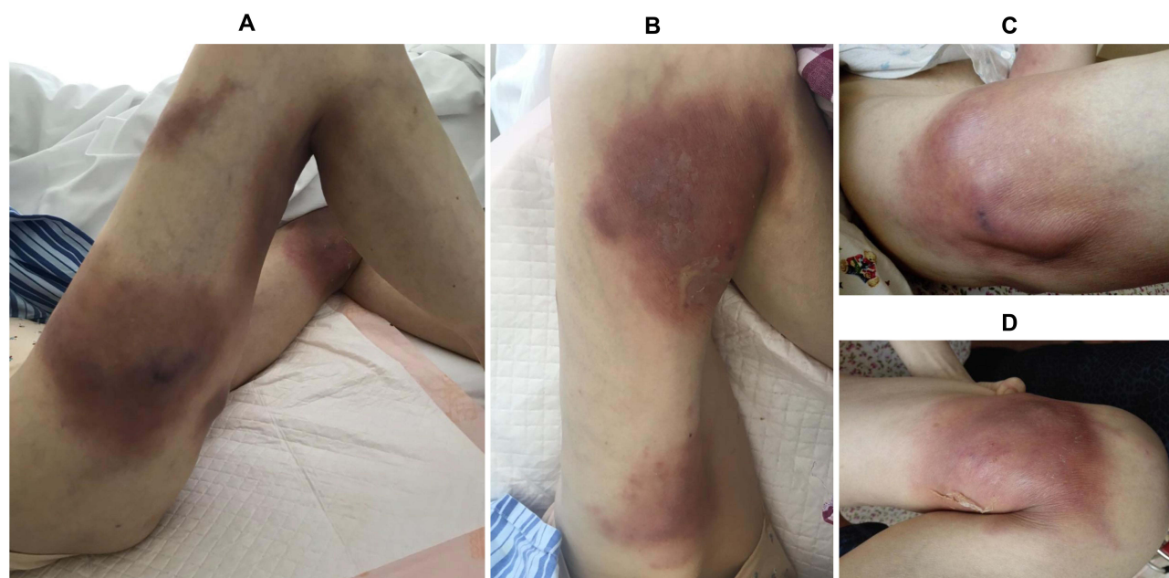
Figure 1 Physical examination of the female patient diagnosed as mediastinal small cell carcinoma complicated with primary cutaneous cryptococcosis. Multiple painful skin lesions with erythema and swelling on both thighs (A and B). Abscesses on both thighs (C and D).