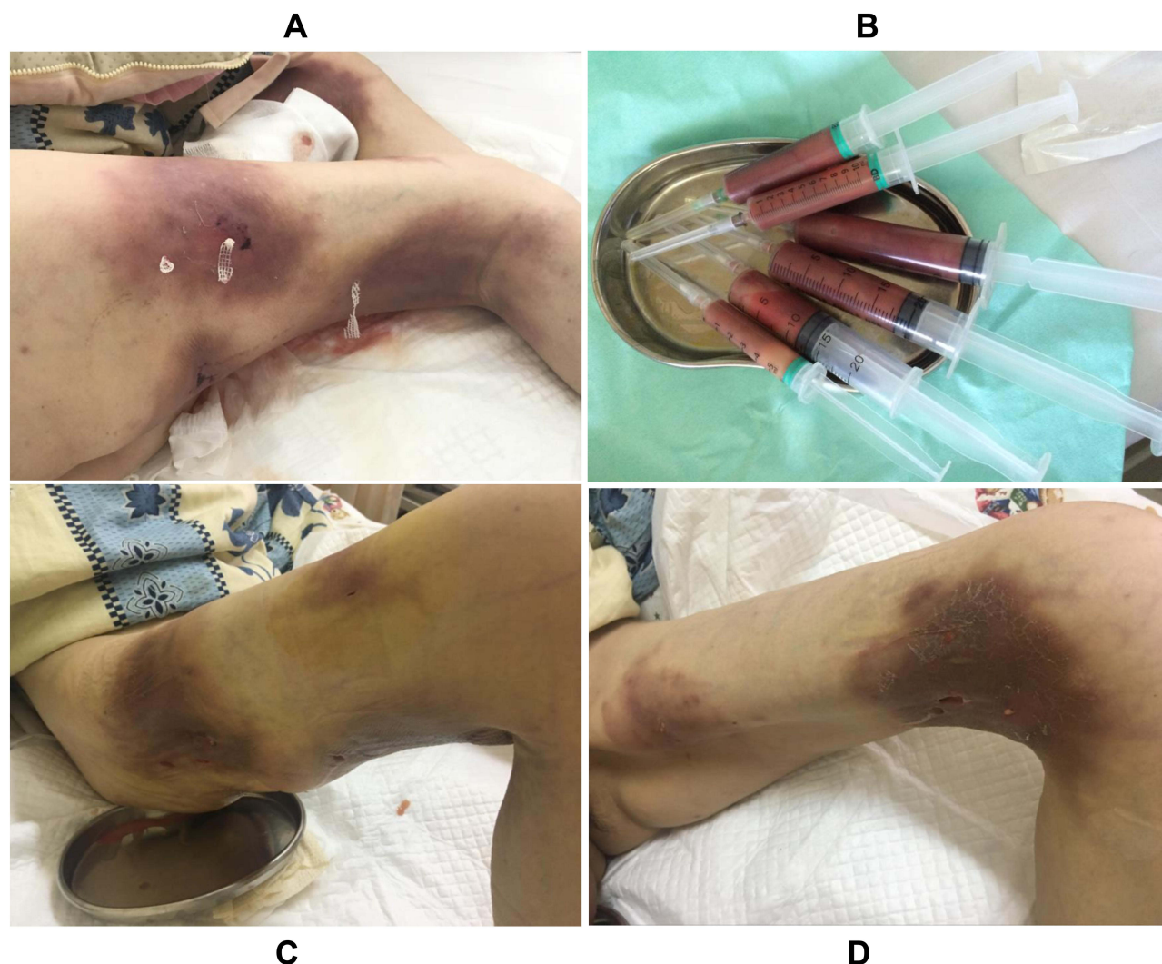
Figure 3 Treatment with cutting the abscesses and lavaging the abscess cavities with fluconazole saline solution (A). A large amount of pus from the abscesses (B). Inflammation within the skin lesions was obviously improved after a week of treatment (C and D).

occurrence of PCC is mainly due to immunodepression as a result of MSSC metastases without treatment. Although the patient succumbed to the progression of the cancer six months after discharge, the topical treatment of fluconazole achieved a favorable outcome with no recurrence of skin lesions. Fluconazole is routinely used as a broad-spectrum antifungal agent in the treatment of cryptococcosis, usually administered orally or intravenously. 18 In addition to this systemic antifungal agent treatment, the abscesses were incised and the abscess cavities were lavaged with fluconazole saline solution, to reduce the progression of the lesions. Although the patient had terminal cancer with multiple systemic metastases, presenting cachexia, hypoproteinemia and was immunocompromised, which increased her chances of being infected, there was no systemic dissemination due to the infection found at the time of admission.