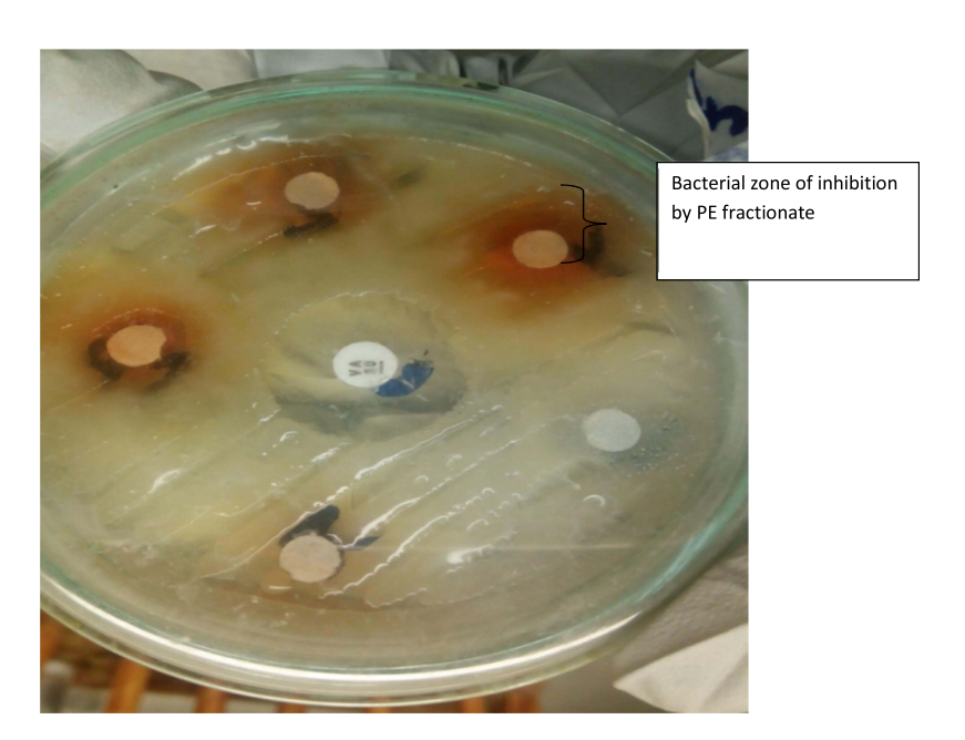
Figure 2 Agar well diffusion test by PE fractionate of the leaves of A. schimperi against K. pneumoniae. (+ve CAF disc as a positive control and 5% DMSO as a negative control).