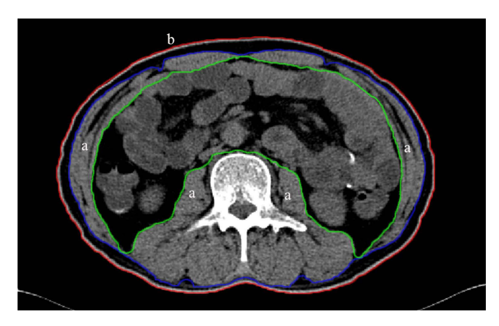
Figure 1 Example of transverse computed tomography images at 3rd lumbar vertebra. a: skeletal muscles area (between green and purple lines) b: abdominal perimeter (red line).

The baseline characteristics of all eligible patients are outlined in Table 1. The median age was 58 years (range, 28–80 years), and 43 were male. There were 34 patients in poor general condition (PS of 2). Further, 35, 65, 62, 48, and 46 patients had worse GOOSS (0 or 1), nutritional risk (NRS 2002 scale \geq 3), severe malnutrition (PG-SGA category C), PNI \leq 45, and NLR \geq 2.5, respectively. The median overall