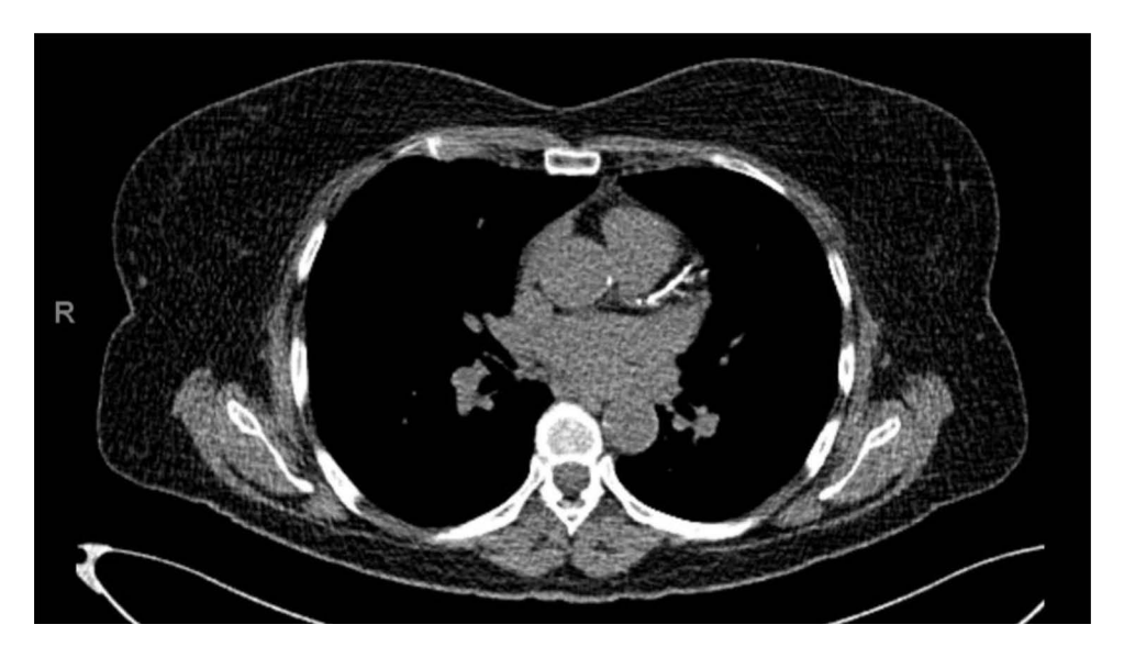
Figure I Coronary calcium scan showing diffuse severe coronary calcifications.

Case 2: Coincidentally, her sister was referred independently to the same clinic for uncontrolled hyperlipidemia. She was a 54-year-old female with hyperlipidemia diagnosed 20 years ago. A lipid panel showed a TC of 423 mg/ dL, LDL-C of 292 mg/dL, HDL-C of 59 mg/dL and TG of 360 mg/dL. Lp(a) was mildly elevated at 46 mg/dL. There was no other relevant medical history other than mild obesity with body mass index of 31, and she had no