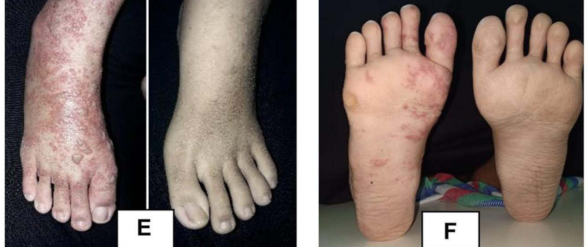
Figure 2 Dermatologic examination. Appearance of vesicles and some were confluent into bullae with erythematous base scattered on cruris dextra (A and D), lateral side of femur dextra (C), gluteus (B), and dorsum and plantar pedis dextra (E and F). Appeared striae on lateral side of right femur (C).