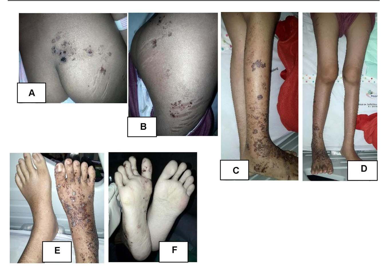
Figure 5 Follow up at 10th day. Showed hyperpigmented patches and and several sagging bullae, some burst into erosion covered by brownish crust at gluteus (A), lateral side of femur dextra (B), cruris dextra (C), and dorsum and plantar pedis region (D-F).

HZ lesion may initiate with tingling sensation, itch, or pain, or both for 2–3 days. These symptoms can last until the lesion appeared or may occur episodically.<sup>10</sup> Besides pain, other symptoms that may arise are constitutional symptoms such as malaise, cephalgia, and other flulike symptoms, which usually will disappear when the skin eruption appeared. Regional lymphadenopathy may also occur.<sup>7</sup>