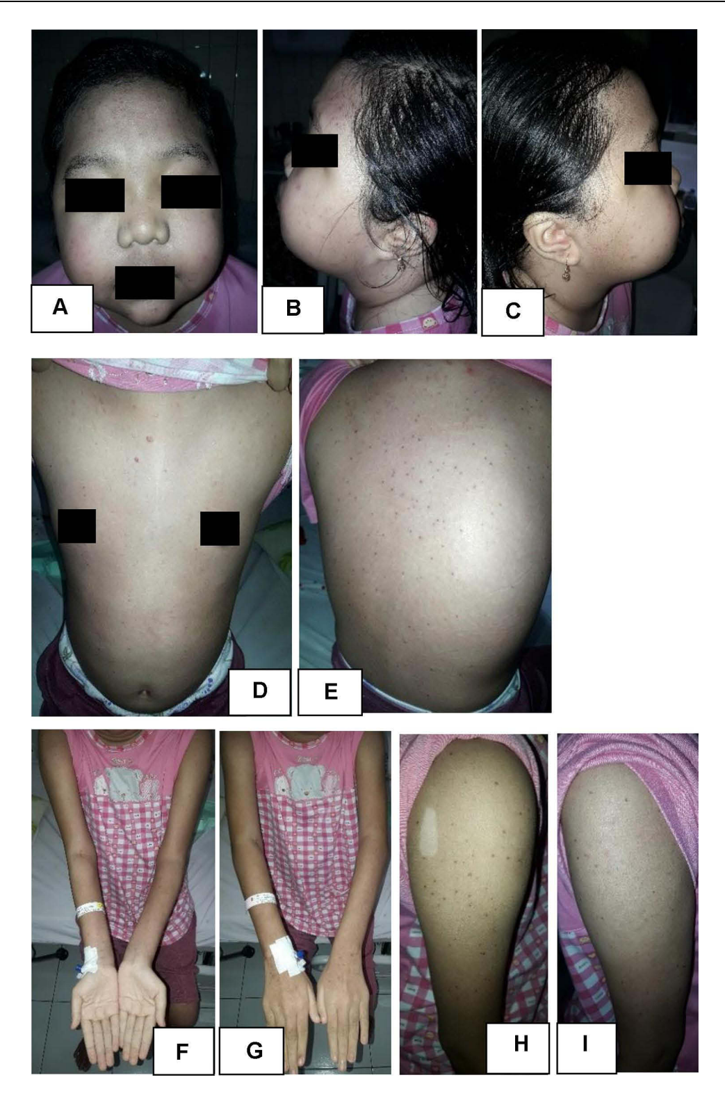
Figure 4 Follow up at 10th day. Showed hyperpigmented macules and patches on facial region (A–C), anterior (D) and posterior trunk (E), and upper extremity (F–I).

reactivation of VZV may occur, causing HZ in approximately one-third of infected people beforehand. ^8