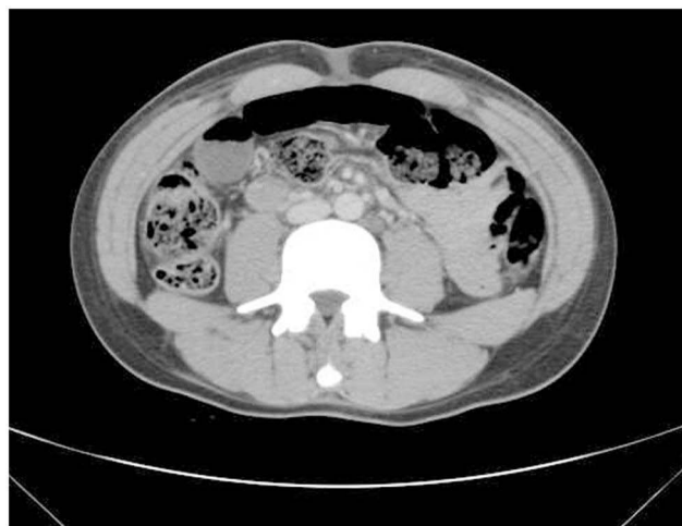
Figure 1 Enhanced abdominal CT taken on day 14. Part of the intestine was dilated and there was gas and fluid accumulation, and the gas-liquid level was visible.

treatment, including fasting, gastrointestinal decompression and stomach protection. The symptoms of abdominal pain gradually relieved over days. The count of WBC reached a maximum of 41.45 \times 10^9/L , IDA (5 mg/day for 2 days) was then adopted. The WBC count gradually decreased. On day 25, the patient's blood cells had recovered after supportive treatment, and he received ATRA (20 mg/day) to continue the induction therapy. During treatment with ATRA, no APL DS-like manifestations or abdominal pain occurred. On day 33, a subsequent bone marrow examination showed that he had achieved complete remission associated with incomplete recovery of blood cells (CRi). The clinical course is illustrated in Figure 2.