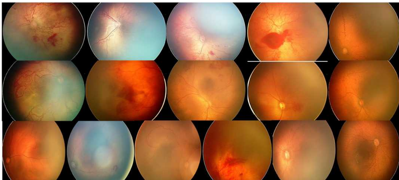
Figure 2 Retinal images of the patients with APROP.

patients ( p < 0.001 ). 21 Misra et al, 2008 reported that pre-threshold type 1 ROP can occur before 6–7 weeks postnatal age especially in SGA babies and therefore recommended earlier screening starting at 4 weeks PNA for SGA babies. 20