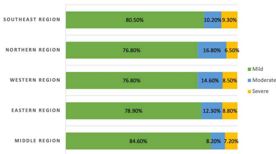
Figure 1 Anxiety level among different regions of Saudi Arabia. The y-axis shows the region, while the x-axis shows the percentages of anxiety in different regions. The green bar indicates mild anxiety, the blue bar indicates moderate anxiety, and the yellow bar indicates severe anxiety.

( P=0.121 ). The participants' age played a significant role in anxiety among Saudi residents during the first wave of the pandemic ( P < 0.001 ).