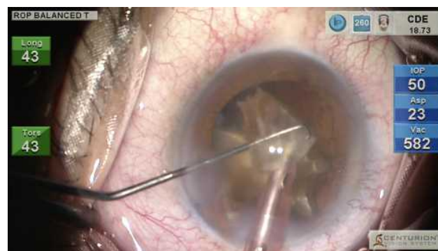
Figure 1 Chopper shield: parts of the chopper such as the tip, shaft-tip junction, and the shaft lie horizontally shielding the endothelium from nuclear fragments during emulsification.

The appropriate placement of the chopper between the phaco tip and the corneal endothelium prevented the chattering nuclear fragments from bouncing upwards and striking the endothelium ( Figure 1 ). The chopper was intermittently used to rotate the nucleus and maneuver the fragments towards the phaco tip while it maintained the protective scaffolding function above the phaco needle during actual emulsification. Once emulsification was complete, routine irrigation and aspiration of the residual cortex was completed and a foldable, single piece, Tecnis 1 monofocal IOL (Model no ZCB00, Johnson and Johnson Vision) was implanted in the bag and the wounds sealed with stromal hydration.