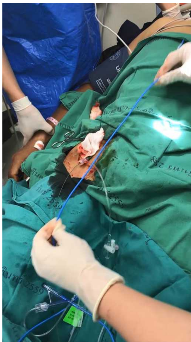
Figure 2 The Aortic Balloon was being inserted into the right Common Femoral artery via the vascular sheath.