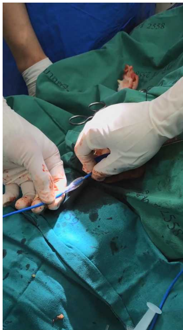
Figure 3 The length of the aortic balloon was being measured by the distance between the right groin and mid sternum to ensure the balloon was placed in the Zone I of the Aorta.

balloon for the anesthesiologist to resuscitated the patient. After that, we deflated the balloon again. The total aortic occlusion time took 90 minutes. The patient's blood pressure was approximately 120/75 millimeters of mercury by arterial-line after the operation.