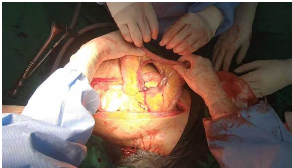
Figure 4 The mesenteric avulsion of the jejunum with active bleeding from the mesenteric vessels.

procedure helps abdominal and pelvic trauma, ruptured aortic aneurysm, gastrointestinal hemorrhage, and post-partum hemorrhage. 15 There is a meta-analysis found that there was 4–5% of groin access associated complication after the use of REBOA. 16 Another meta-analysis also mentions the use of REBOA in management for significant hemorrhage, 89 articles and 28 case reports found that REBOA increases systolic blood pressure in hemorrhagic shock patient as an adjunct for definitive surgery in hemodynamic instability with an iatrogenic vessel injury during approach below 5%. 2