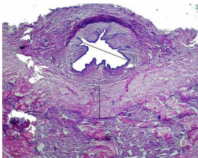
Figure 1 Representative control cross section (20 \times ). The maximum diameter of the lumen was 2350 \mu\text{m} and the collagen fiber layer was 351 \mu\text{m} thick. Mild to moderate inflammatory infiltration and poor neovascular formation is seen.