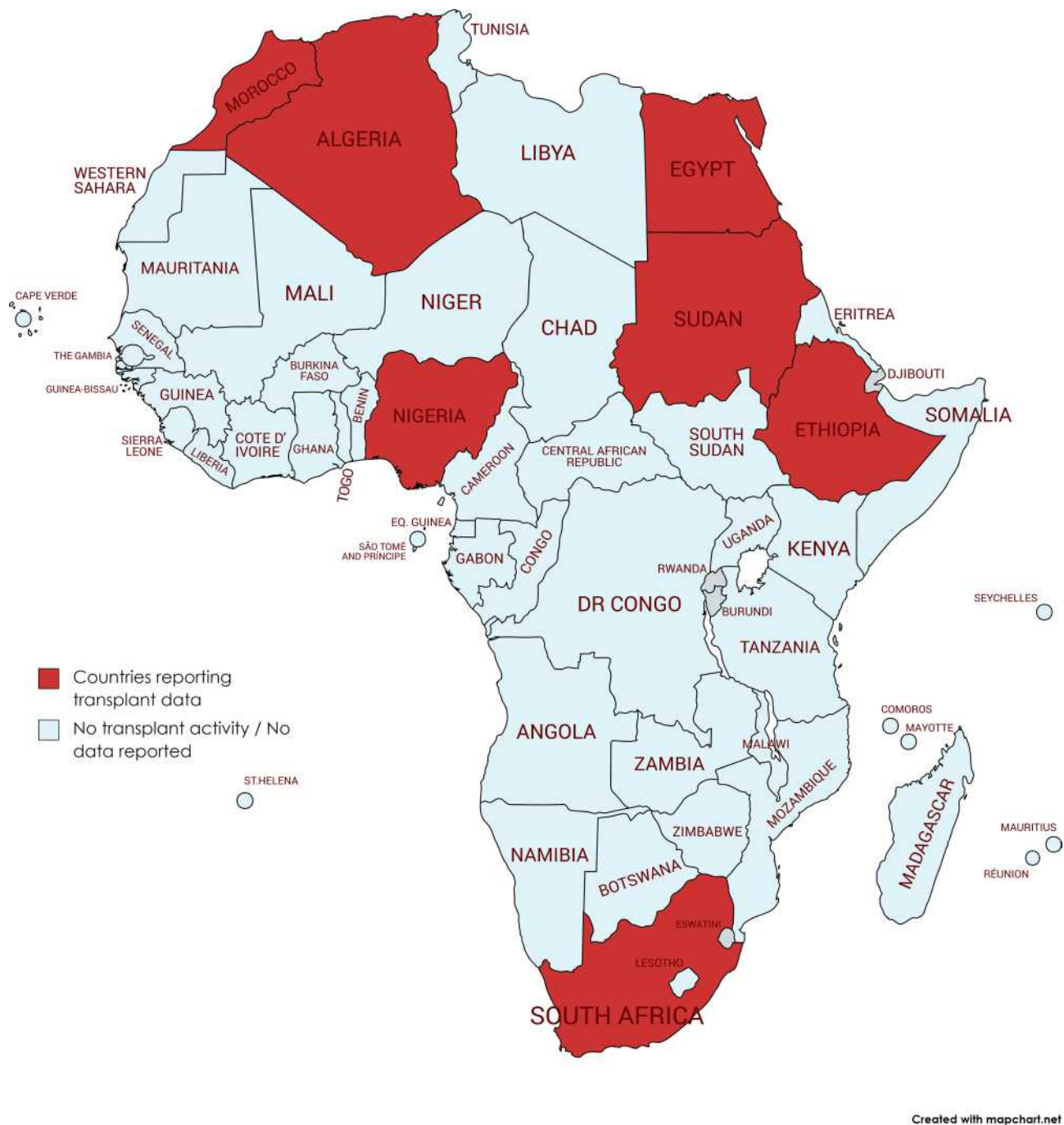
Figure 1 This figure shows reported transplant activity across the continent of Africa (areas shaded in red). The blue areas either do not report transplant activity, or do not host any transplant activity. It is clear from this image, that organ transplantation is available to a very limited extent across the continent.

deal with transplant-related offences, leaving many developing countries vulnerable to organ trafficking. 42 This further diminishes public trust and collective willingness to buy into organ donation.