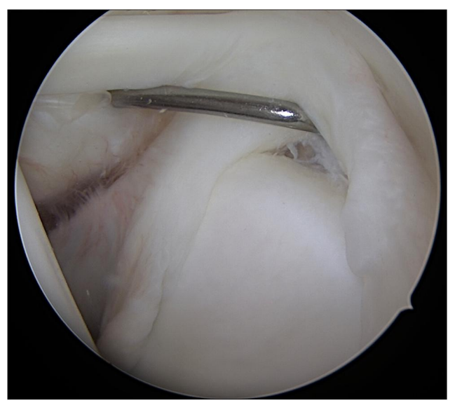
Figure 3 An arthroscopic image of a type II SLAP lesion.

In their prospective study on the nonoperative management of SLAP lesions, Shin et al found that, of 46 patients, 39 (85%) had improvement in their American Shoulder and Elbow Surgeons (ASES) scores, Visual Analog Scale (VAS) for pain, and Constant scores at final follow-up, though these were only recreational athletes. In their case series, Edwards et al also showed improvement in