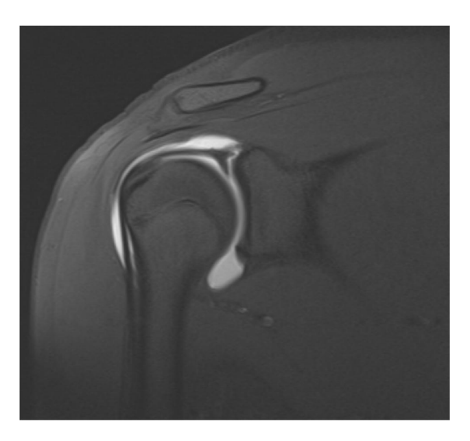
Figure 1 A coronal slice of a magnetic resonance arthrogram showing a type II SLAP lesion in a female college gymnast.

SLAP lesions were first classified by Snyder et al in 1990. 18 Type I lesions account for approximately 11% of SLAP tears and are characterized by both biceps and labral fraying, with an intact anchor. Type II tears account for approximately 41% of tears and are characterized by labral fraying with a detached biceps tendon anchor (Figure 1). Type III lesions account for 33% of tears and are characterized by a bucket-handle type tear of the labrum with an intact biceps tendon anchor. Finally, type IV tears account for approximately 15% of tears. They are characterized by a bucket-handle type tear of the superior labrum with a biceps tendon separated from the scapula, but still attached to the bucket-handle portion of the superior labrum. 18