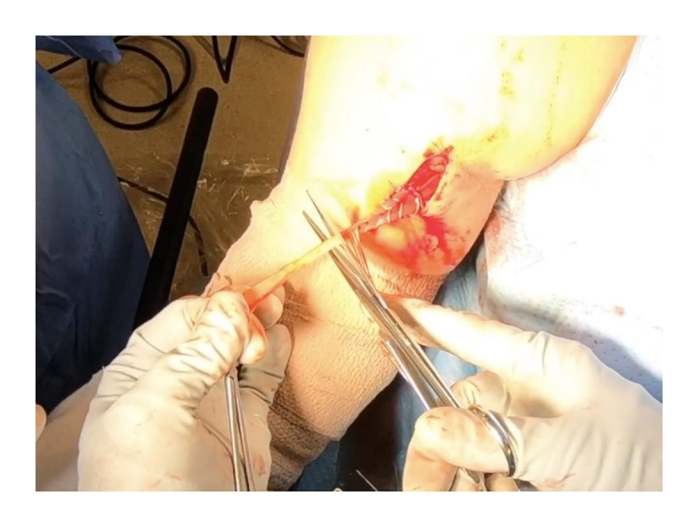
Figure 5 In this image of a biceps tenodesis in a right shoulder, the biceps tendon has been retrieved through the open incision lateral to the axillary fold. The image shows a whip stitch through the musculotendinous junction and the surgeon demonstrating the location to excise the proximal tendon with scissors.

The senior author uses an endocortical button for fixation of the tendon. It should be noted that suture anchor