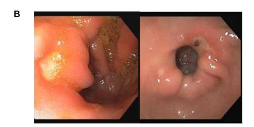
Figure 2 Morphologic characteristics of malignant (A) and benign (B) ulcers. (A) malignant gastric ulcers. Ulcers are usually large (more than 1 cm) with irregular borders. Borders are elevated compared to the base, and base discoloration is commonly present. (B) Benign gastric ulcers. Ulcers are usually smaller (less than 1 cm), with a clean base and regular flat borders.

assigned a probability between 0 and 1. Thus, as in logistic regression, a cut-off probability of 0.5 is targeted by the model to maximize accuracy. Lesions with a probability higher than 0.5 are considered malignant. Those with a probability of less than 0.5 are considered benign. Different cut-off values can be used for a tradeoff between sensitivity and specificity. We evaluated the metrics for different cut-off probabilities of the model (0.3, 0.5, and 0.7).