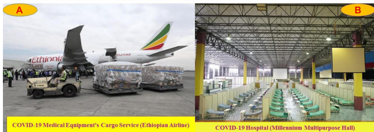
Figure 2 Ethiopian Airline Cargo Services (A) and new COVID-19 hospital in Ethiopia (B) Millennium Multipurpose Hall.

emergency crises national response. 16 Jack Ma & Alibaba Foundation, Bill & Melinda Gates Foundation, and Byte Dance & Tik Tok have generously donated COVID-19 testing kits, PPE materials, and financial support which would worth millions of USD. The government also got €10 million to support the preparedness and response plan to the pandemic, African development bank provided a regional (continental) floating fund grants, European Humanitarian Aid and Civil Protection (ECHO), United Nation's Central Emergency Response Fund (CERF), Korea International Cooperation Agency (KOICA), and German Development Cooperation. These all bilateral, and multilateral supports are the result of effective foreign and diplomatic relationships. 16