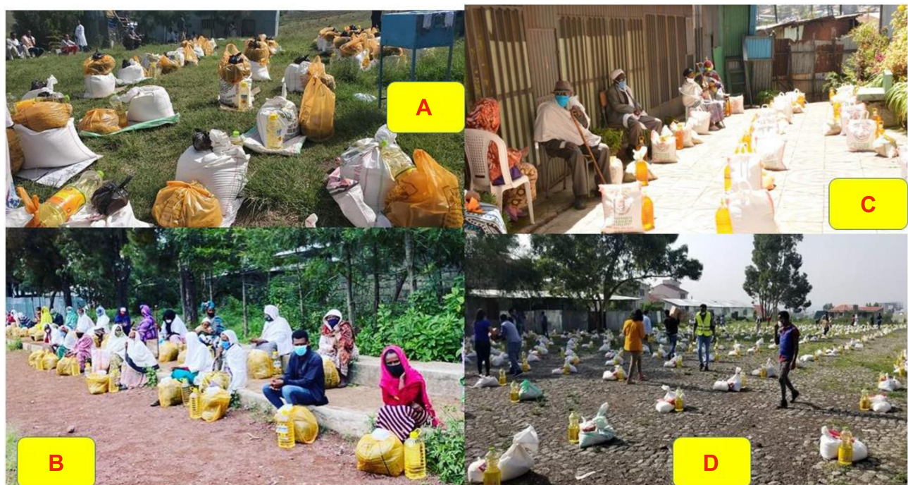
Figure 3 Social organizations; (A and B) religious network support, (C) Neighborhood network support and (D) youth and voluntary association support to reduce the COVID-19 socioeconomic crises.

Furthermore, since the COVID-19 pandemic outbreak, private organizations, business firms like hotels and individuals, and public contributed to alleviate the consequences by availing their wealth and services for free (see Box 1)