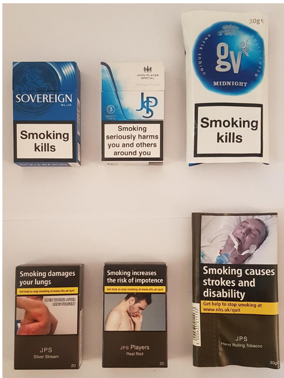
Figure 1 Examples of flip-top cigarette packs and rolling tobacco pouches pre-standardized packaging (top row) and post-standardized packaging (bottom row).

2020 for the second 16 ). Academic topic experts were also contacted.