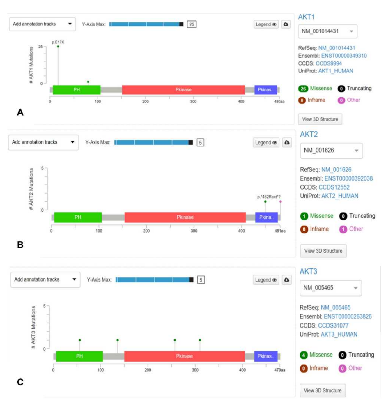
Figure 3 Diagram of domains of (A) AKT1, (B) AKT2 and (C) AKT3 with mutations identified in the GDPH cohort. Abbreviation: PH, pleckstrin homology.

Chinese population were missense mutations, among which 80.6% were detected in the major hotspots concentrated in the helical region (E17K). Conversely, AKT1-E17K mutation was absent in patients of the TCGA cohort. This unique high-frequency mutation in the Chinese population suggests that it could serve as a risk factor for breast cancer in the Asian population. The E17K mutation is located near the specific binding