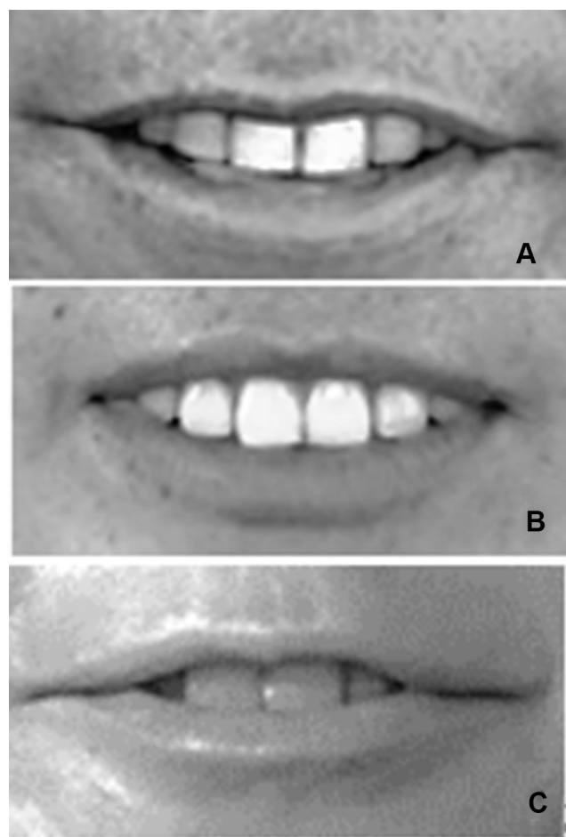
Figure 2 Three kinds of position relations between upper central incisors edge and lower lip. (A) Separate; (B) contact; (C) overlap.

above can be used to evaluate the length and shape of the upper incisors and can be taken into consideration during restorative procedures. Meanwhile, the upper central incisors are close to the superior border of the lower lip. Hence, evaluating the position relationships between these two factors can be used to guide the position relationship of the upper central incisors to the lip and palate. According to the analysis of the above phonetic features, the present study was designed to evaluate certain tooth–