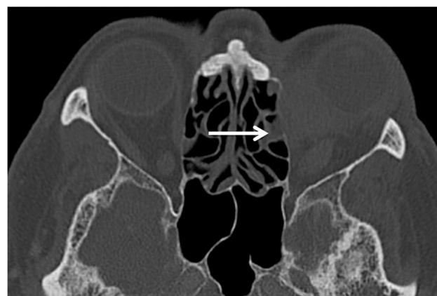
Figure 4 Infiltration of the lacrimal system and ethmoidal cells (arrow) in a patient with IgG4-ROD (axial CT scan with contrast agent, bone window).

The most important results of this study include that, apparently, no specific clinical sign and no morphologic cross-sectional imaging sign reliably distinguishes between IgG4-ROD and OAL. Yet, time from clinical