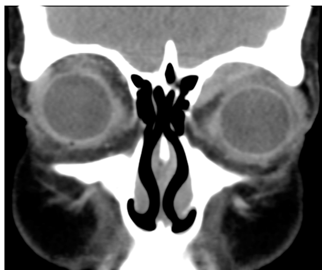
Figure 1 Bilateral periocular tendon involvement in a patient with OAL presenting via blurry muscle insertions of the four recti muscles (coronary CT with contrast agent, soft tissue window).

Except for differences in tumor lesion volume, no individual cross-sectional imaging feature distinguished between IgG4-ROD and OAL. When compared, however, clinical signs and symptoms were bilateral in 4/13 IgG4-ROD-patients (31%) and 5/29 OAL-patients (17%), while cross-sectional imaging findings involved both eyes more often, in 11/13 IgG4-ROD-patients (85%) and 23/29 OAL-patients (79%, p < 0.001 , McNemar-test). In consequence, bilateral cross-sectional imaging involvement was clinically inapparent in 7/13 IgG4-ROD-patients (54%) and 18/29 OAL-patients (62%). When statistically comparing the number of patients presenting with bilateral disease between groups, no statistically significant difference could be found, neither