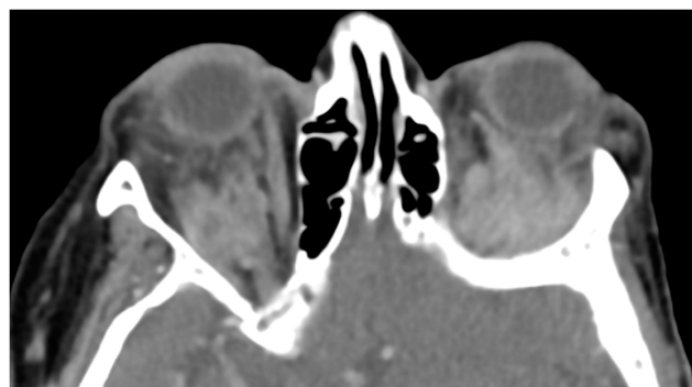
Figure 3 Bilateral infiltration of the orbital fat pad in a patient with OAL (axial CT scan with contrast agent, soft tissue window).

grouped for clinical nor radiographic bilateralism (Mann–Whitney U -test, n.s.).