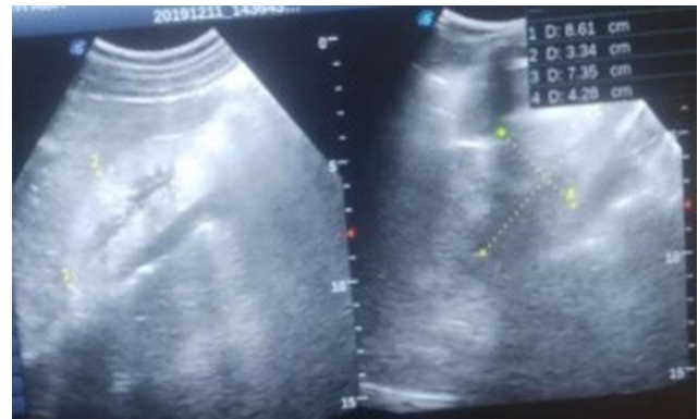
Figure 5 Renal ultrasound showing bilateral small echogenic kidneys.

the loss of corticomedullary echo differentiation. There were no renal cysts, calculi, or calyceal dilatation. Also noted was pelvic ascites. A diagnosis of bilateral chronic renal parenchymal disease with pelvic ascites was made.