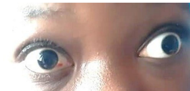
Figure 1 Showing right eye subconjunctival hemorrhage, Left divergent squint and bilaterally markedly dilated pupils.

A renal ultrasound scan showed bilateral small kidneys measuring 8.61cm × 3.4cm and 8.31 × 4.28cm on the right and left sides respectively ( Figure 5 ). (Normal kidney sizes for her age are 10.74±1.35cm and 11.0 ±1.15cm on the right and left side, respectively. 5 ) There was a grade 3 increase in renal parenchymal echoes with