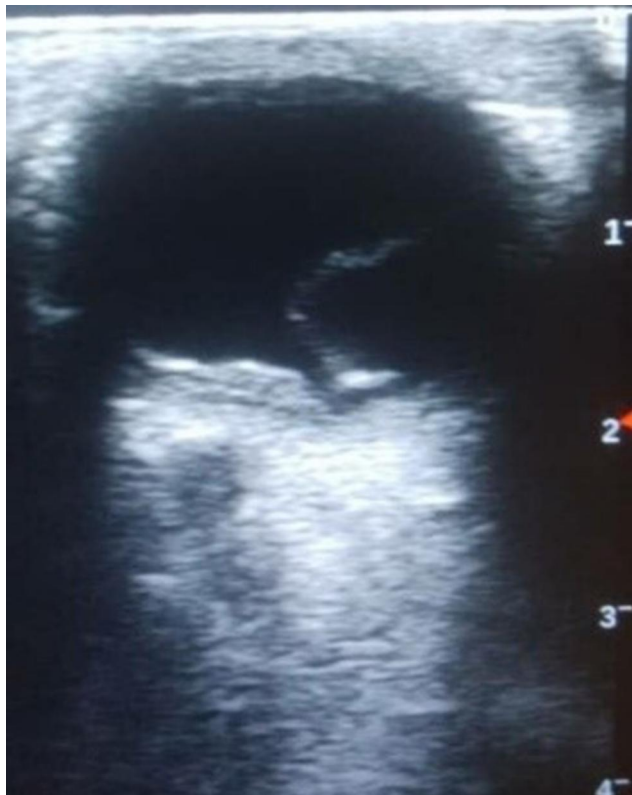
Figure 4 B-mode ocular ultrasound of the left eye showing retinal detachment.