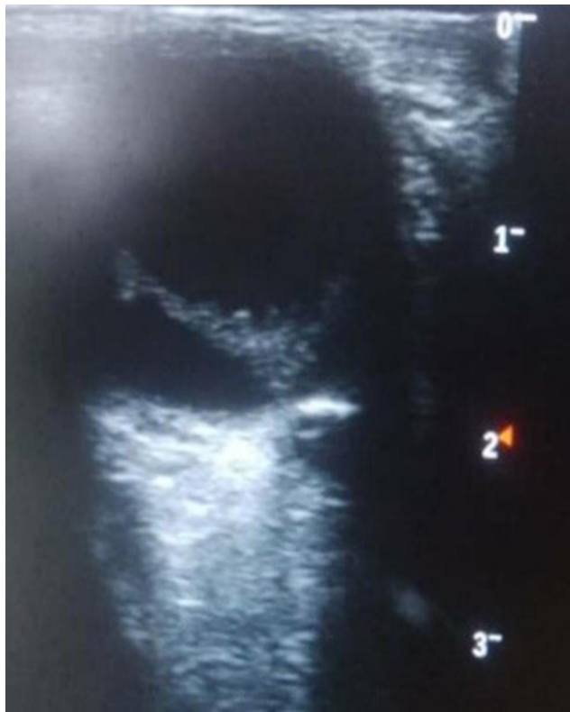
Figure 3 B-mode ocular ultrasound of the right eye showing retinal detachment.