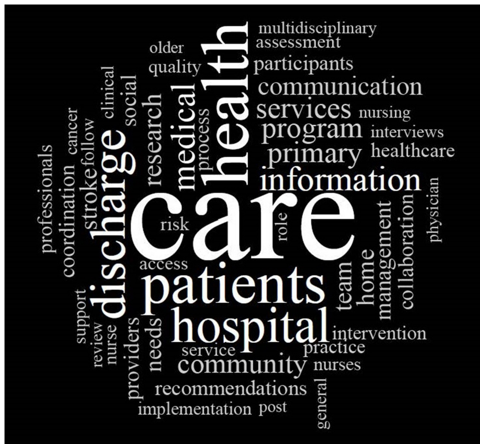
Figure 2 Word cloud of 50 most frequent words.

a contributing factor, 38,51,54,55 resulting in one-way communication, 51 with hospital discharge summaries often not received in time to be relevant to primary care practitioners 53,59 and/or without establishing a shared understanding by determining if the information is according to need and/or understood. 54