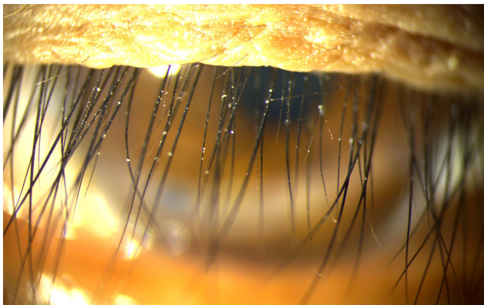
Figure 2 Slit-lamp photograph of scaly debris, appeared as flakes adhered on eyelashes.