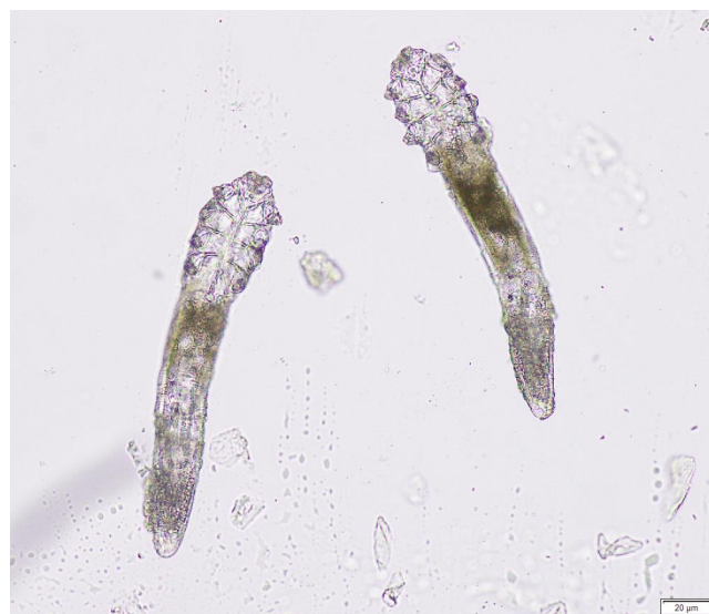
Figure 4 Demodex spp. from light microscopy.

Data were entered, cleaned, and analyzed using IBM SPSS Statistics for Windows, Version 23. Data in this study were normally distributed as determined by the Kolmogorov–Smirnov test. Quantitative variables were described by means and standard deviations (SDs), and qualitative variables were described by frequencies (percentages). A chi-square test was used to compare qualitative variables (i.e., age groups, clinical findings on lids), and an independent t -test was run to compare the means of qualitative variables. The risk of blepharitis in the participants with Demodex infestation was determined by univariable