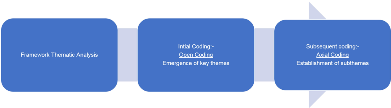
Figure 2 Stages of qualitative analysis process: an illustration.

Member checking also included sending the summary of coding and themes back to four participants who had indicated that they were willing to receive this summary via the CCWA and OCA support group coordinators.