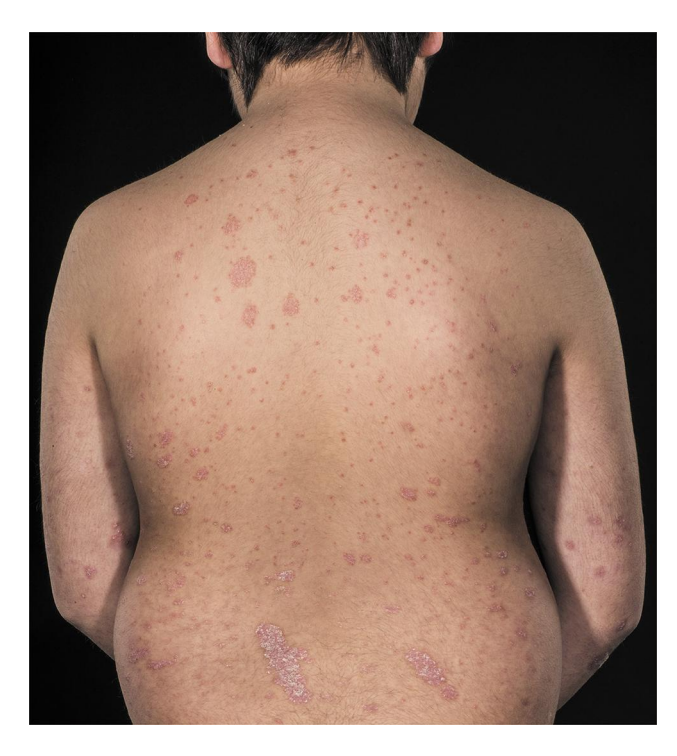
Figure I Mixed plaque and guttate psoriasis on the back of a 9-year-old boy.