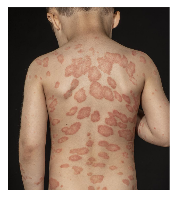
Figure 2 Plaque psoriasis on the back of a 4-year-old boy.

four months but still had residual plaques. The patient is still being treated with MTX, and a combination of vitamin D analogs, while betamethasone dipropionate gel is used for flares.