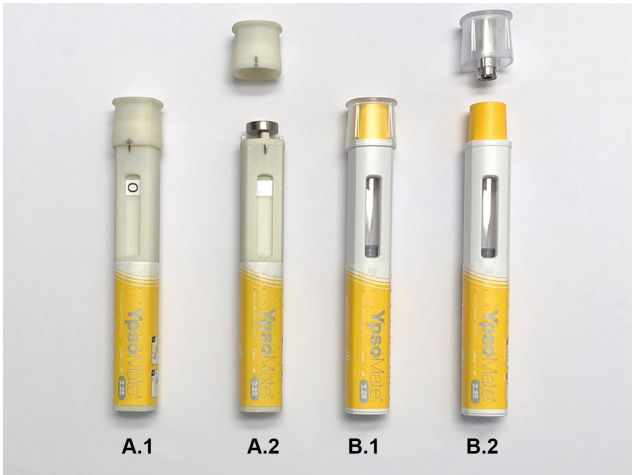
Figure 1 Non-functional mock-up autoinjector device used to simulate decapping handling step before (A.1) and after cap removal (A.2), and fully functional pre-filled autoinjector device before (B.1) and after cap removal (B.2).

55 N (device F_{T55} ). The shape and size of the mock-up devices were akin to the actual autoinjector platform device described earlier (Figure 1). 2,11,39,41 A ferromagnetic target in the cap and a permanent magnet in the device body separated by a variable air gap were used to achieve the different target cap-removal forces. Adjusting the air gap between the target and the permanent magnet with a lead-screw mechanism in the body enabled adjustment of the target cap-removal forces. The cap-removal forces were experimentally verified using a Zwick Roell Z 2.5 universal test machine (Zwick GmbH, Ulm, Germany). The results of the measurements are presented in Table 2.