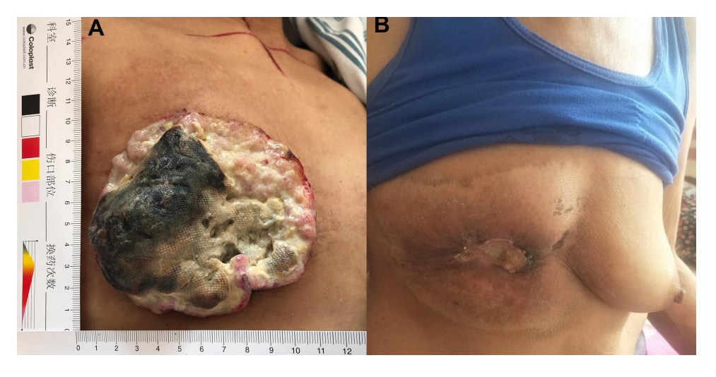
Figure 2 The effect evaluation between pre-RT and 2 months after RT. (A) The fungated, cauliflower-like tumor occupied the entire right breast before RT. (B) The tumor shrank significantly and eventually fell off 2 months after RT.

RT plays an irreplaceable role in the treatment of BC; however, the role of RT in LABC requires further exploration. Yee et al retrospectively reviewed 43 inoperable LABC cases, although TNBC was excluded from this analysis. RT delivered to the breast, chest wall, or related regional lymph nodes contributed to a median local progression-free survival (PFS) of 12 months. Eighty-four percent of the cohort demonstrated a good response to RT, with tumor shrinkage during the 3 months after RT. Of 24 evaluable cases, ulceration and bleeding were significantly relieved in 13 patients. Coelho et al retrospectively analyzed 57 LABC individuals who were refractory to primary systemic therapy. RT of 50 Gy/25 fractions