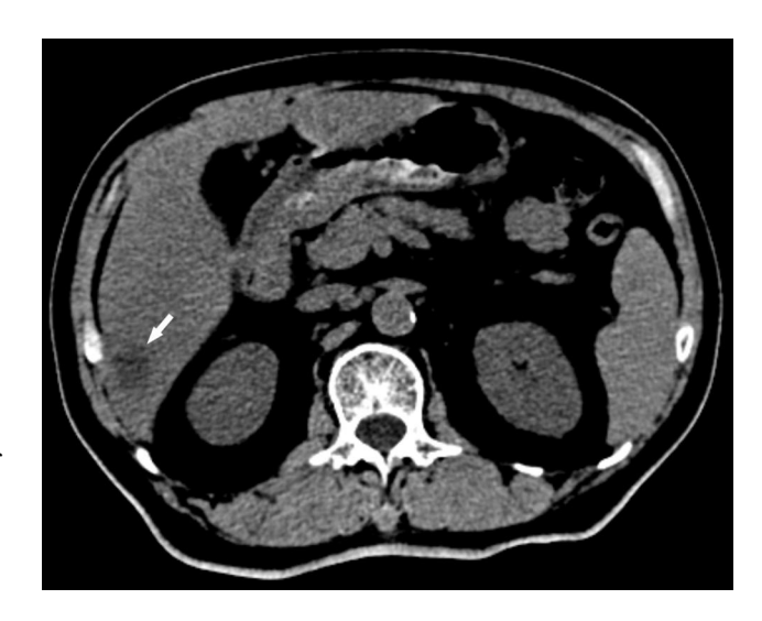
Figure I Abdominal CT scan showed a right lobe liver abscess (rounded, low density areas).

He was admitted to the Department of Gastroenterology for further treatment. Laboratory investigations revealed C-reactive protein 439.43 mg/L (normal range<10 mg/L), serum sodium (Na) 133.9 mmol/L (normal range=136–145 mmol/L), serum potassium (K) 3.71 mmol/L (normal range=3.5–5.3 mmol/L), total bilirubin 21 μmol/L (normal range=3.4–20.6 μmol/L), and alanine aminotransferase (ALT) 88.6 U/L (normal range<50 U/L). Physical examination revealed mild epigastric tenderness. A right lobe liver abscess was identified on CT scan (Figure 1). Abdominal