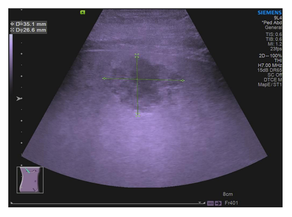
Figure 2 Abdominal ultrasound showed a right lobe liver abscess (mixed echoes, with a size of 3.5cm×2.7 cm).

intravitreal injection of the left eye. Abdominal ultrasonography was performed 6 days after the first therapeutic puncture. The abscess cavity decreased conspicuously