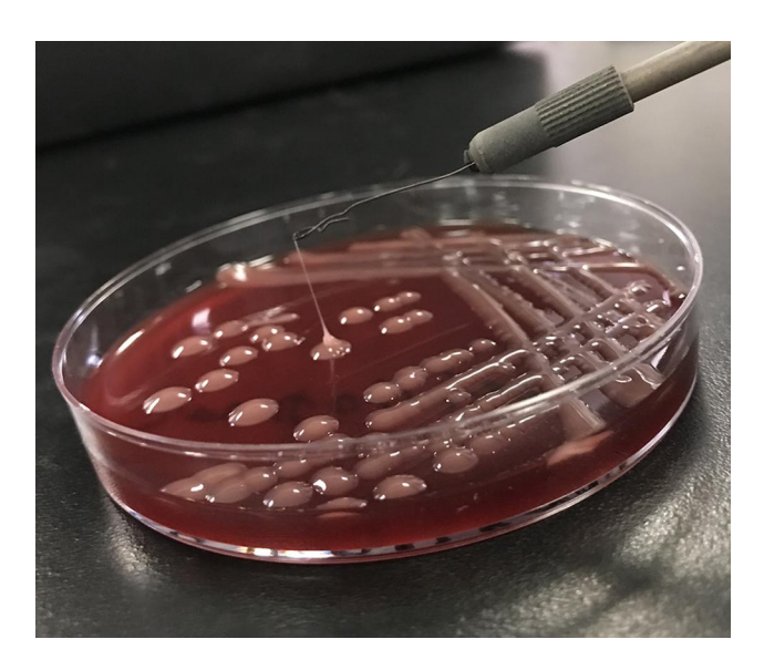
Figure 3 All cultures yielded K. pneumoniae with a positive string test (>5mm in string length).

MLST was performed by PCR amplification as previously reported<sup>9</sup> and this strain belongs to ST1764.