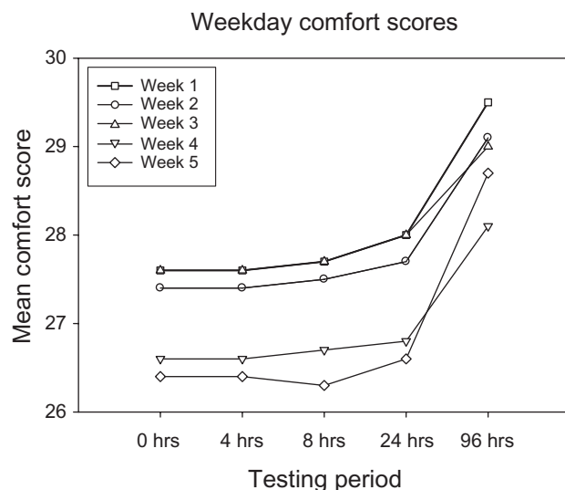
Figure 2 Week day mean comfort.

Table 3 show the mean comfort scores for week day and match day conditions. Week day measures were taken at four time points over 24 hours and 96 hours for the five weeks of measurement. The mean values are plotted in Figures 3 and 4 respectively. For week day results, the mean scores remained fairly constant, at 0, 4, 8, and 24 hours but increased at 96 hours in all weeks. The mean scores in week 4 and week 5 were approximately one point below the mean scores recorded in weeks 1, 2, and 3, and indicated comfort variations between testing weeks.