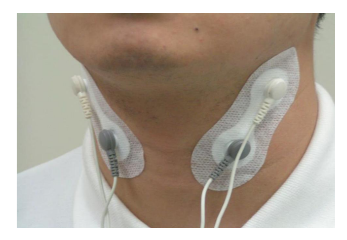
Figure 2 Positions of electrodes. The upper electrodes are placed directly below the mandibular angle, and the lower electrodes are placed at the level of the thyroid cartilage along the anterior edge of the sternocleidomastoid muscle. A 50-beat interferential wave is generated from two different alternating currents (2000 or 2500 Hz).

which was used to indicate the obesity status, and the results of the mini nutritional assessment (MNA) were used as indicators of nutritional state. The MMSE was used to assess cognitive function.<sup>17</sup> In addition, the Barthel index (BI) was used as an index of activities of daily living. 18