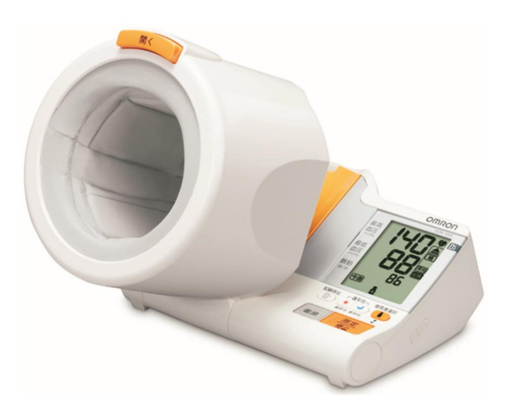
Figure I Omron HEM-1040 blood pressure measuring device.

For each experiment, the manufacturer provided standard production device models. The validation team for each device consisted of three observers who were experienced in measuring BP and trained under the online program of the British and Irish Hypertension Society (https://bihsoc. org/resources/bp-measurement/bp-measurement-ausculta