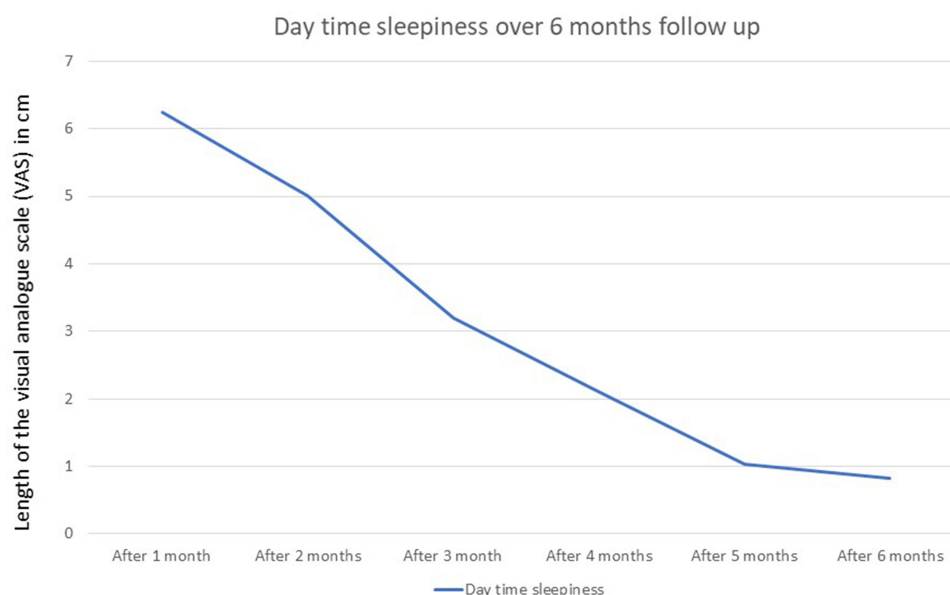
Figure 3 Daytime sleepiness was subjectively measured by the visual analog scale over six months follow-up period. The x-axis on the graph represents the time (in months) and y-axis depicts the length of VAS (in cm) as marked by the patient daily. Daytime sleepiness decreased progressively over 6 months highlighting the importance of assessing it as part of the protracted abstinence syndrome.

the ASI legal problems score showed statistically significant differences between the two groups ( t=16.537 , p=0.001 ). All other subscales were not statistically different for the two groups of participants.