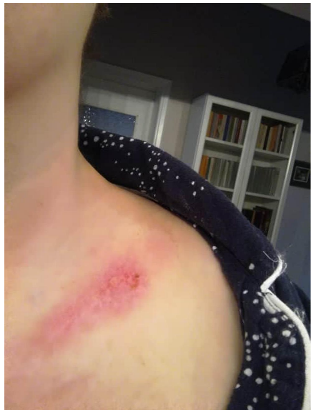
Figure 5 Day 12 post 25 th RT. Day 15 post-AQ therapy. Pain score=1. ARD grade 1.