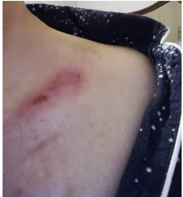
Figure 4 Day 11 post 25 th RT. Day 14 post-AQ therapy. Pain score=1. ARD grade 2.

The patient's progress was monitored online, and she photographed the wound herself regularly (Figure 2–8). The patient was requested to maintain a record of her pain score on a scale of 1 to 10.