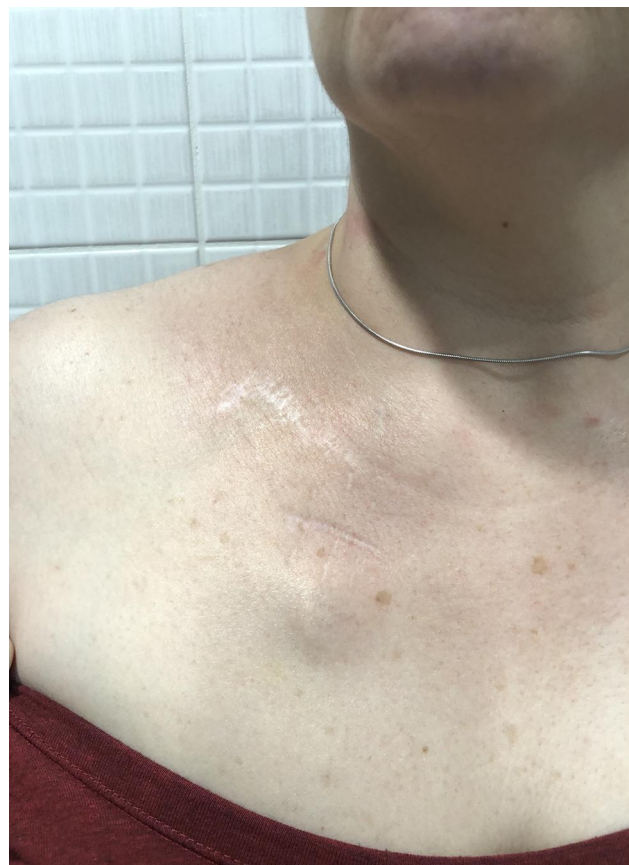
Figure 9 Six months post RT and AQ treatment.

interleukins, cytokines, and growth factors. Hence, it stands to reason that the enhancement of these regenerative protein titers by a topical application may optimize the wound-healing response. Although steroids are commonly advocated to treat radiodermatitis, there is a paucity in the literature on the treatment of the condition with these regenerative proteins. Platelet gels, rich in autologous growth factors, have effectively treated chronic cutaneous radiodermatitis, 15 however, administration of growth factors as creams and solutions has not consistently shown efficacy in their healing properties. 16,17