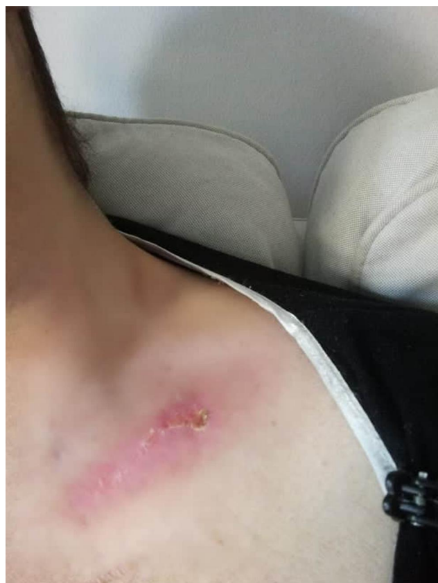
Figure 6 Day 14 post-RT. Day 17 post-AQ therapy. Pain score=1. ARD grade I.

Modulation of the inflammatory response is of paramount importance in the management of radiodermatitis. Successful wound healing proceeds through an orderly progression of inflammation, proliferation, and matrix remodeling, with each stage, depending on several