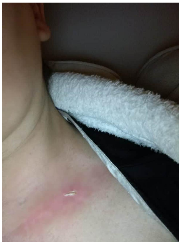
Figure 7 Day 16 post 25 th RT. Day 19 Post AQ therapy. Pain score=0. ARD grade I.

The patient did not experience any complications and was relatively pain-free during the recovery. The outcome