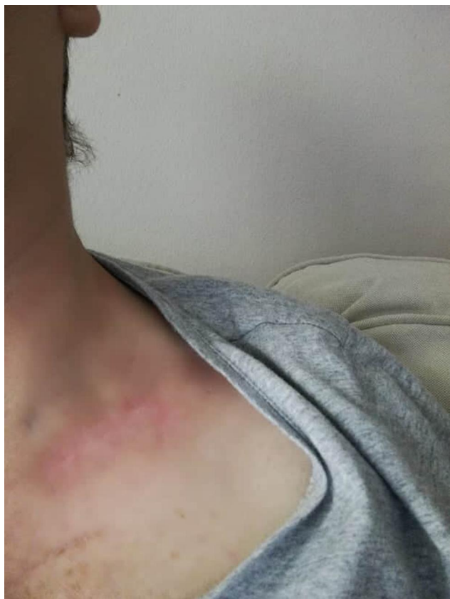
Figure 8 Day 18 post 25 th RT. Day 21 Post AQ Therapy. Pain score=0. ARD grade I.