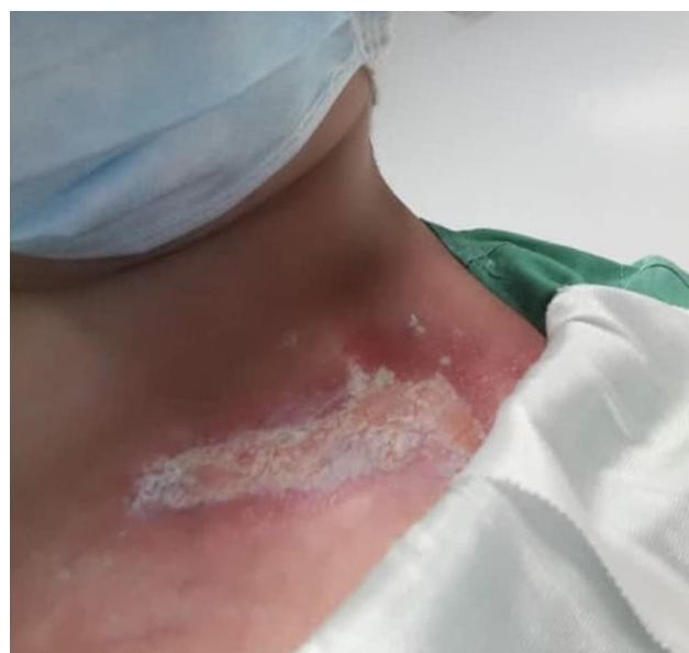
Figure 1 Day 1 post the 22 nd RT session. Day 1 AQ serum therapy. Pain score =7. ARD grade 3.

The patient was instructed to clean the affected area twice a day with saline solution, dry it with sterile gauze, and apply a single dosimeter-press dose of synergistic anti-inflammatory preparation cytokines, interleukins, and growth factors (Active Serum by AQ Skin Solutions, Irvine, California, USA). The patient was instructed to use the AQ active serum twice a day during the 23 rd , 24 th and 25 th RT sessions and for a further four days post-RT. Thereafter, she was instructed to use the serum continuously, once a day.