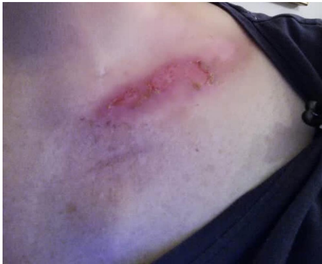
Figure 3 Day 6 post 24 th RT. Day 9 post-AQ therapy. Pain score=2. ARD grade 2.

The preparation derived from cultured human fibroblasts contains Transforming Growth Factors (TGF) Beta-1, 2 and 3, Platelet-Derived Growth Factor (PDGF), Granulocyte Monocyte Colony Stimulating Factor (GM-CSF), and Interleukins (IL) 3, 6, 7 and 8.