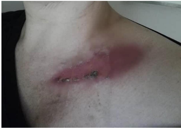
Figure 2 Day 1 post 23 rd RT treatment. Day 4 of AQ therapy. Pain score=3. ARD grade 2.