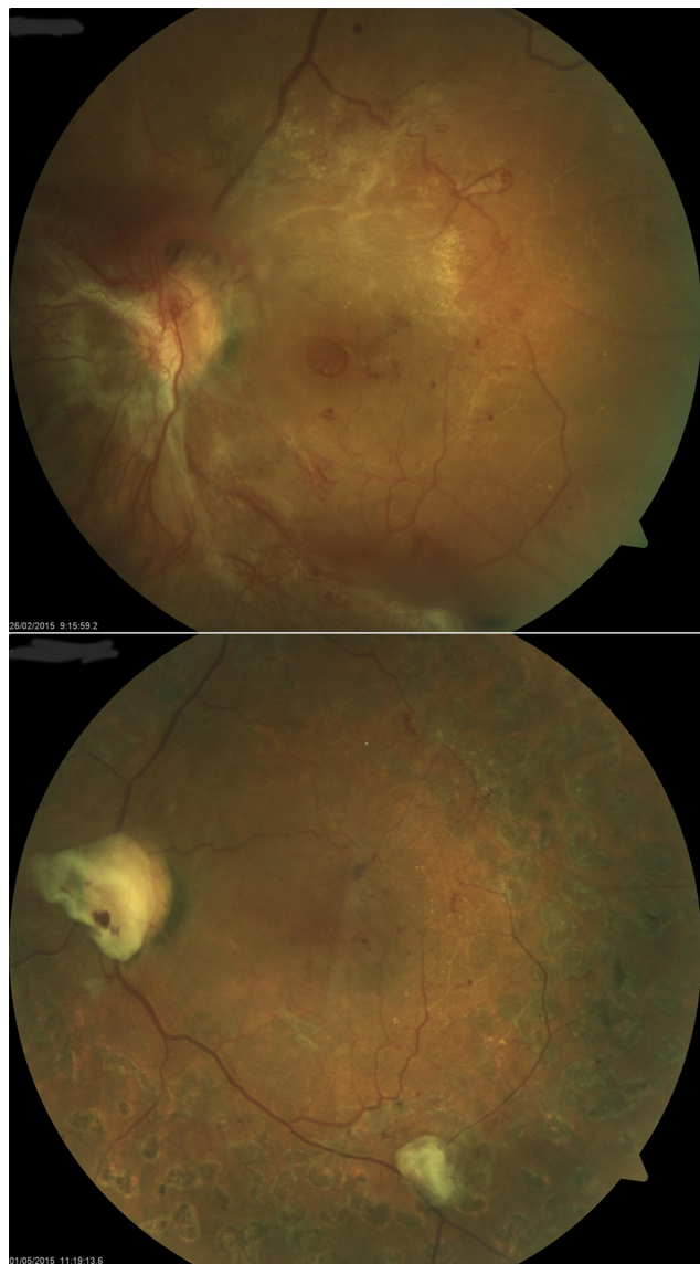
Figure 1 Preoperative appearance (top) of the fundus of the left eye in a 52 years-old diabetic patient with a full-thickness macular hole. Proliferative membranes are seen with active neovascularization. After vitrectomy (bottom) with ILM peeling, retina is quiet, membranes are removed and macular hole is closed.

acting air-gas mixture was injected at the end of surgery. Residual vitreous cavity haemorrhage was noted in 2 patients (14.3%), with complete resorption at 6 weeks after surgery.