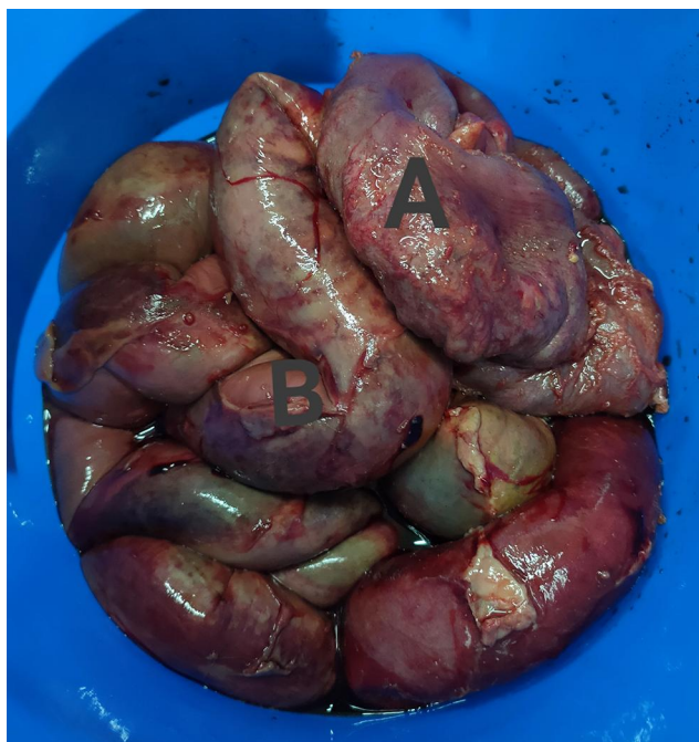
Figure 3 Postoperative photograph shows the surgical specimen (A: gangrenous sigmoid colon; B: gangrenous ileum loop).

intertwisting of the two parts of the intestine occurs, leading to a vicious torsion giving rise to compression and a double loop obstruction. Strangulation and gangrene of the ileum and sigmoid colon occur rapidly due to the tightness of the knot and involvement of the mesentery. 1-3,11-14 These processes distinctly explain