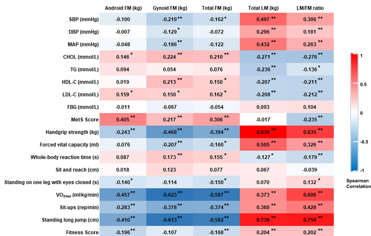
Figure 3 Correlations between body composition, cardiometabolic risk factors, and physical fitness.

Notes: Results are Spearman correlation coefficients. * p < 0.05 , ** p < 0.01 . The fitness score was the sum of the sex-specific z-score for physical-fitness test items (handgrip strength, forced vital capacity, whole-body reaction time, sit and reach, standing on one leg with eyes closed, maximal oxygen consumption, sit-ups, and standing long jump). A higher fitness score indicates a better level of physical fitness. The MetS score was the sum of the z-score of the following metabolic traits: mean arterial pressure [(2 \times \text{diastolic blood pressure}) + \text{systolic blood pressure}] / 3 ; android FM; FBG; TG, CHOL, HDL-C* and LDL-C. A higher MetS score indicates a worse cardiometabolic profile. Abbreviations: CHOL, cholesterol; DBP, diastolic blood pressure; FBG, fasting blood glucose; HDL-C, high-density lipoprotein-cholesterol; LDL-C, low-density lipoprotein-cholesterol; MAP, mean arterial pressure; SBP, systolic blood pressure; TG, triglycerides; VO 2max , maximal oxygen consumption.