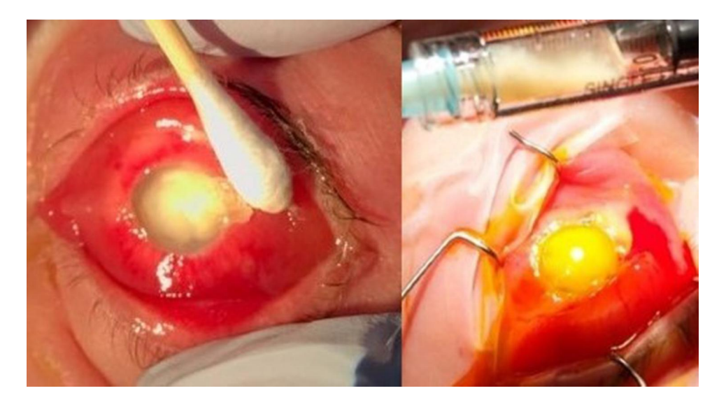
Figure 2 Examination under anesthetic demonstrating marked chemosis, dense corneal infiltrate with a large hypopyon and periorbital erythema. Note the purulent fluid aspirated from vitreous tap.