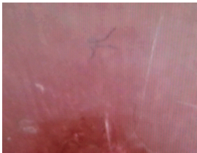
Figure 5 Fiber under epidermis (top) and separate from a skin lesion (bottom). Magnification 30 \times .

The convenience sample included all patients seen in the first author's San Francisco medical office who met the inclusion criterion. The subject inclusion criterion was a positive examination for microscopic subcutaneous fibers as visualized by the first author using a 60 \times handheld lighted magnifier. There were no exclusion criteria for the sample