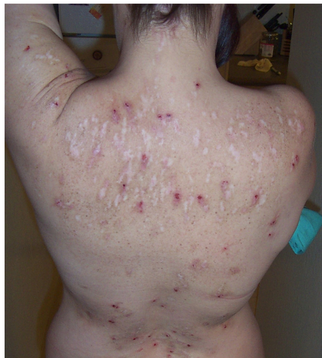
Figure 2 Morgellons patient's back. Note that lesions and scars occur in areas that could not have been reached by the patient. Reproduced with permission.

In order to identify a homogeneous population for research purposes, it is important to develop a clinically-based case definition for Morgellons disease. To this end, we studied a group of subjects selected for a unique inclusion criterion in order to describe demographic, comorbidity, and symptom characteristics common to the population of Morgellons patients.