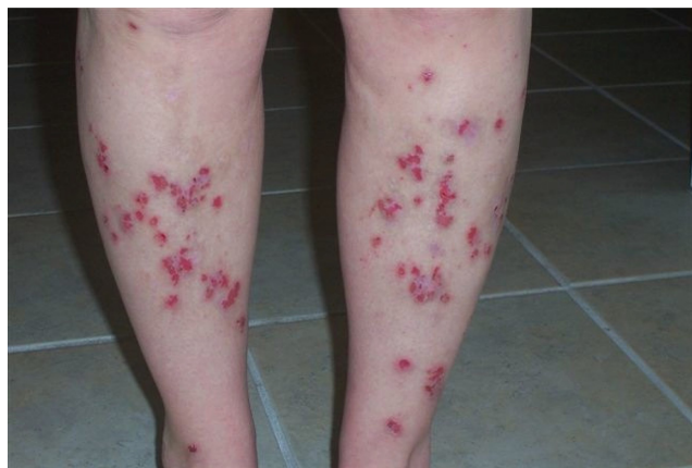
Figure 1 Morgellons patient's lower legs. Similar lesions covered her trunk and arms. There were no excoriations or secondary infections. Photo courtesy of Cindy Casey, Charles E Holman Foundation, Austin, Texas. Reproduced with permission.

modern medical literature, the reluctance on the part of the medical community to recognize it as anything other than psychopathology, and the lack of knowledge about its etiology and transmission. 6