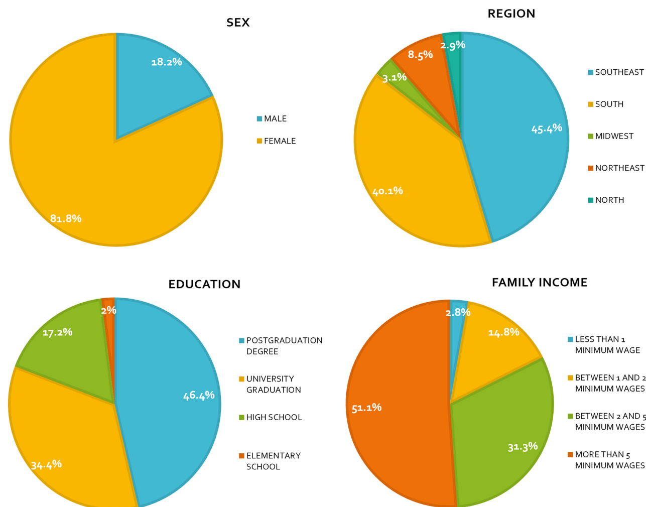
Figure 2 Demographics and sample characteristics.

sequence were observed, one was excluded. The answers and data obtained were stored by the researchers and used only for this study.