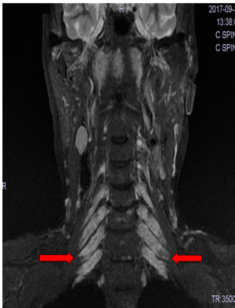
Figure 3 Cervical magnetic resonance imaging (MRI) without contrast medium enhancement. All bilateral brachial nerves are identified as gigantic on a coronal T2-weighted image. The red arrow shows the enlargement of the cervical nerves.

nerve in CMTD may also be sensitive to non-depolarizing muscle relaxants, resulting in prolonged neuromuscular blocking. 14 Inhalational agents may also present some risks to CMTD patients. However, Isbister et al 15 suggested that nitrous oxide would be safe. Intravenous anesthetics, including propofol, fentanyl, alfentanil, and thiopental, are also considered relatively safe since they do not appear to elicit high sensitivity. 14 In the current case, only intravenous anesthetics were used.