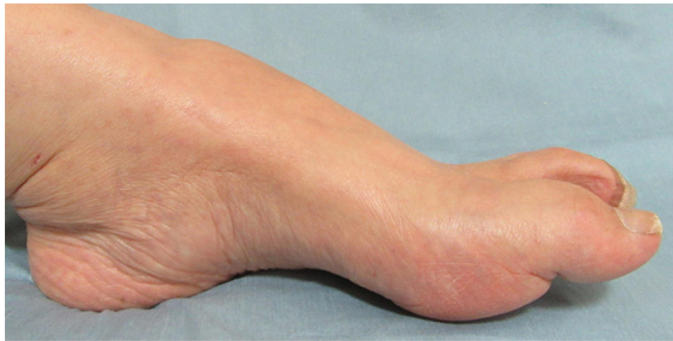
Figure 2 The patient's feet as a pathognomonic characteristic of CMTD, showing high arches and claw toes. The patient had not noticed these abnormalities. Abbreviation: CMTD, Charcot-Marie-Tooth disease.