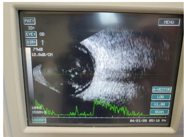
Figure 2 B-scan ultrasonography of the eye for the first case one day post-operatively showing vitreous hemorrhage and complete retinal detachment.

The wound was tested and found watertight and 0.1 cc of Vigamox 0.5% (Alcon, Geneva, Switzerland) was injected in the anterior chamber (AC) at the end of the surgery. At day one postoperative, a B-scan ultrasonography (Sonomed AB5500+ E-Z Scan, NY, USA) was performed. The B-scan revealed no lens in the vitreous body and a complete retinal detachment (RD) with vitreous hemorrhage (VH). The patient was referred to a vitreoretinal surgeon. Figure 2 Steroid (Pred Forte 1%, Allergan, Dublin, Ireland) and antibiotic (Vigamox 0.5%, Alcon, Geneva, Switzerland) eye drops were given four times/day in the first postoperative day. The antibiotic eye drops were stopped two weeks postoperative and the