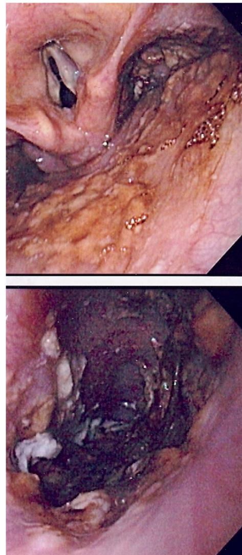
Figure 2 Esophageal candidiasis.

A reliable diagnosis can only be made by direct visualization of the esophagus along with histological evidence of tissue invasion in biopsy material. 22,21 However,