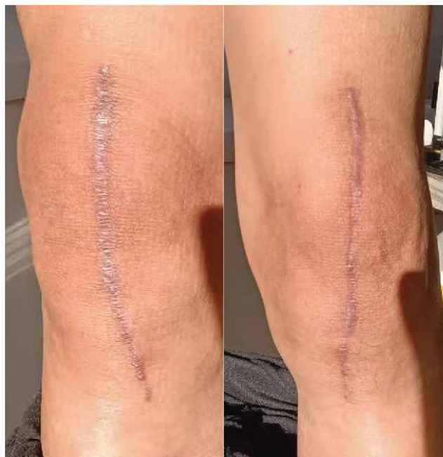
Figure 4 The appearances of bilateral incisions at postoperative two month (right: tissue adhesive group; left: control group).

This was the first study on comparing the clinical outcome, medical cost and patient preference of tissue adhesive plus subcuticular sutures with just subcuticular sutures in simultaneous bilateral TKA. The prospective and self-controlled clinical trial has eliminated the patients' personalized characteristics, such as BMI, individual healing abilities and systemic disease.