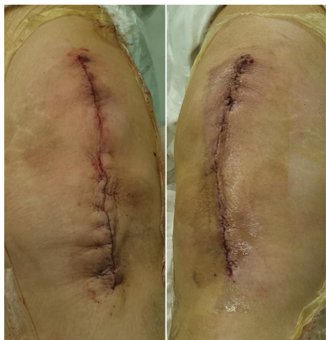
Figure 1 The appearances of bilateral incisions in the operating room (right: tissue adhesive group; left: control group).

index (BMI), postoperative length of stay (LOS), the times of dressing changes and the incision-related cost, were collected. Any delay in regular discharge (postoperative 4 days) due to incision was recorded.