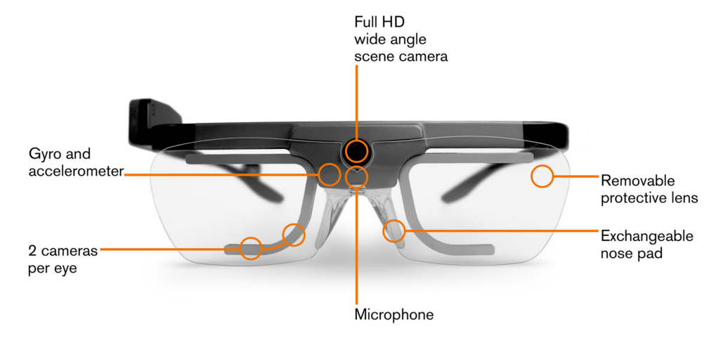
Figure I The Tobii Pro Glasses 50 Hz wearable wireless eye tracker.

Eye-tracking metrics were mapped as gaze plots and heat maps. Gaze plots show the location, order, and time