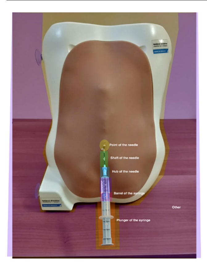
Figure 2 Areas of interest (AOI).

spent looking at locations on the stimulus. Time spent looking, most commonly expressed as fixation duration, is shown by the diameter of the fixation circles. The longer the look, the larger the circle.