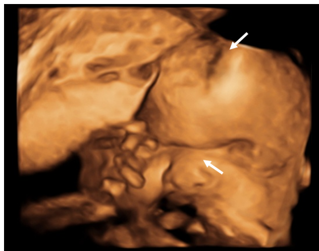
Figure 1 3D-ultrasound at 29 WGA. The foetus has frontal prominence and a cloverleaf skull suggestive of craniosynostosis and hypoplastic nasal bone (white arrows).

A new generation sequencing panel study was performed. It studies 241 genes potentially responsible for one or more Mendelian diseases related to hereditary osteodysplasia, collagen diseases and short stature. We found a heterozygous