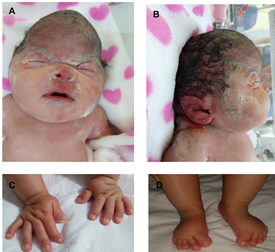
Figure 2 Physical findings at birth. (A and B). Female newborn with cloverleaf skull, hypertelorism, facial hypoplasia, low ears, exophthalmos, (C) short and deviated hallux and (D) thumbs.

this characteristic does not exclude the diagnosis, as well as its presence does not directly certify this syndrome, because other diseases can also present. 7 The presence of wide fingers, sacral appendix, vertebral fusions and coronal clefts in the prenatal ultrasound should lead the clinician to perform prenatal molecular tests to rule out PS. 2,7 Almost all cases of PS are a consequence of new mutations because the parents are unaffected. Nevertheless, there is a percentage where the abnormal gene can be inherited from either parent. In the cases where FGFR2 mutations could be inherited from the father, Cell-free DNA extracted from maternal plasma can provide valuable molecular information and identify the genetic diagnosis in utero. 16