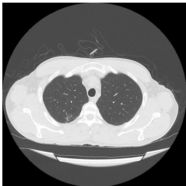
Figure 2 Computed tomography scan of the chest of a liver transplant man with coronavirus 2019 (COVID-19) showed a small peripheral patchy ground-glass opacity in right lung.

respiratory syndrome coronavirus 2 (SARS-CoV-2). This virus spread rapidly around the world and is now a public health emergency. 2 The clinical features of COVID-19 patients are very diverse. Pulmonary symptoms are common in COVID-19, but some patients may show symptoms other than the respiratory tract, including neurological manifestations, and changes in smell and taste. 1,6 One of our patients presented with severe headache as a sign of neurological disease.